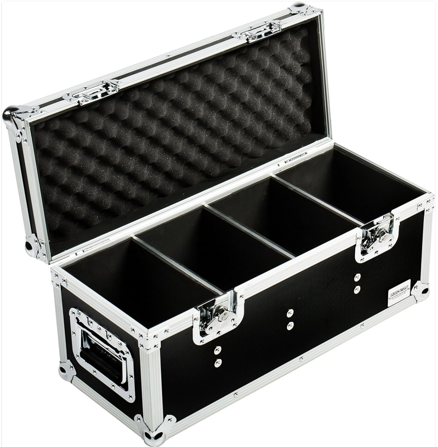
Figure 2: The TOUR CASE opened, revealing four padded compartments for individual spotlights.