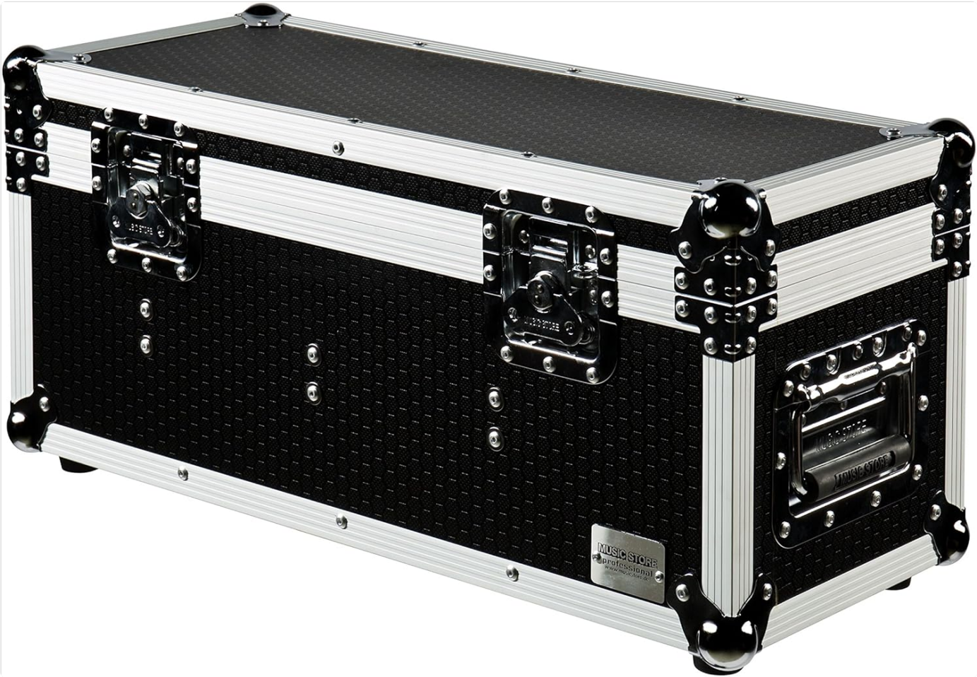
Figure 3: Side view of the TOUR CASE, highlighting the robust carrying handle for easy transport.