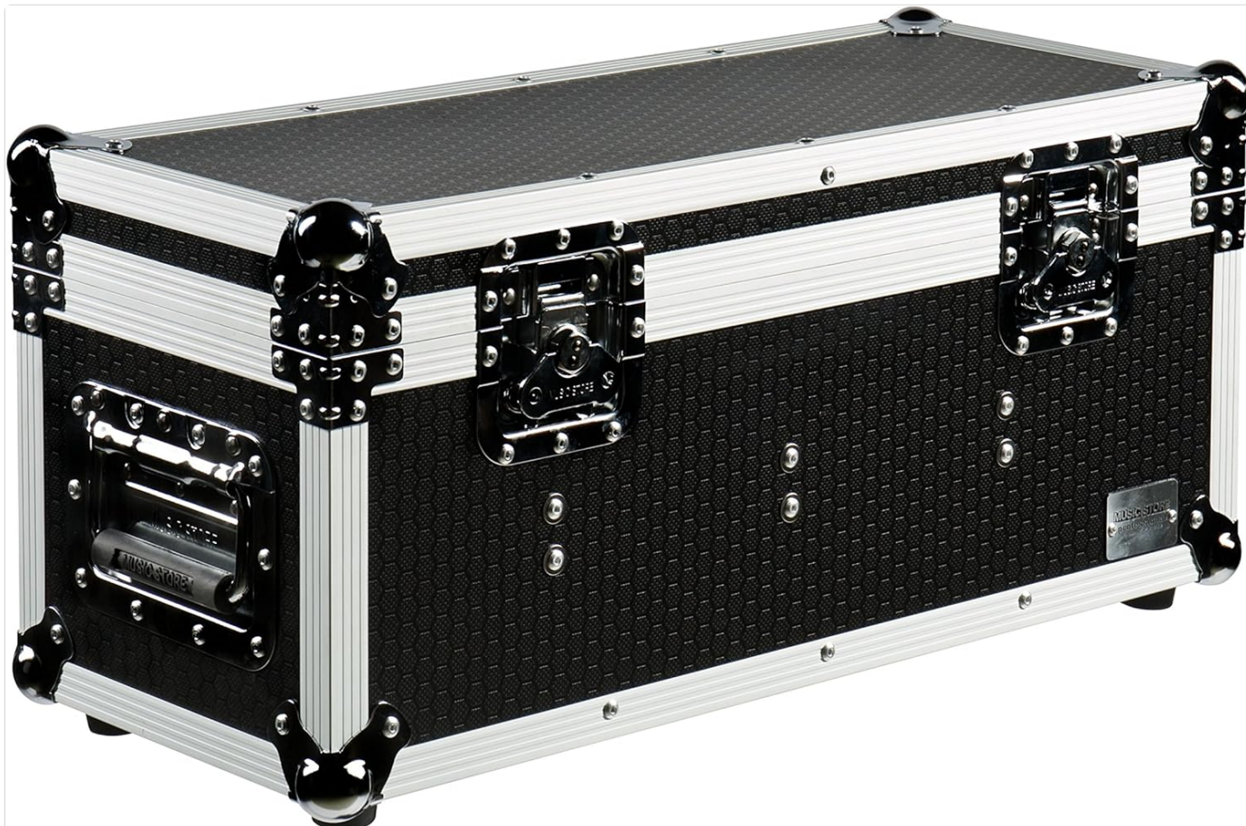
Figure 1: The lightmaXX TOUR CASE in its closed state, showcasing its durable exterior and secure latches.

This manual provides essential information for the safe and effective use of your lightmaXX TOUR CASE. This robust flight case is designed to securely transport and protect up to four FLAT PAR COB, QUAD, MINI, TRI, or Vega PAR COB spotlights. Please read this manual thoroughly before using the product to ensure proper handling and longevity.