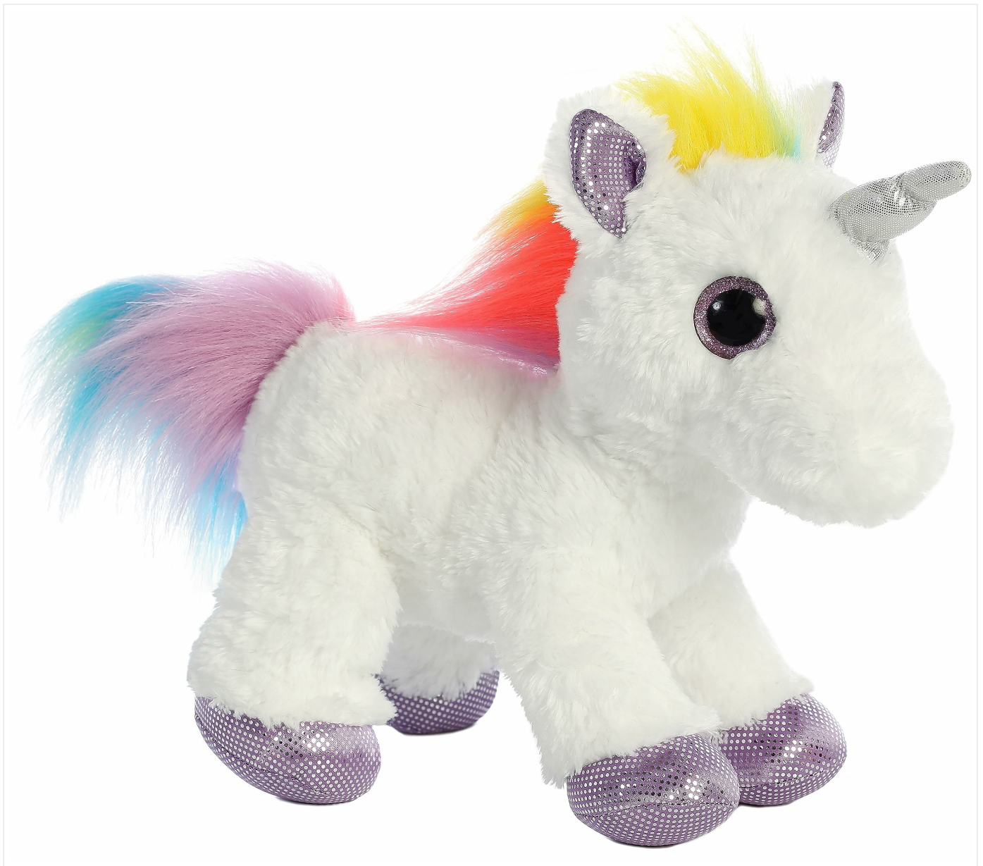
Image: The Aurora Rainbow Unicorn plush toy, ready for play.