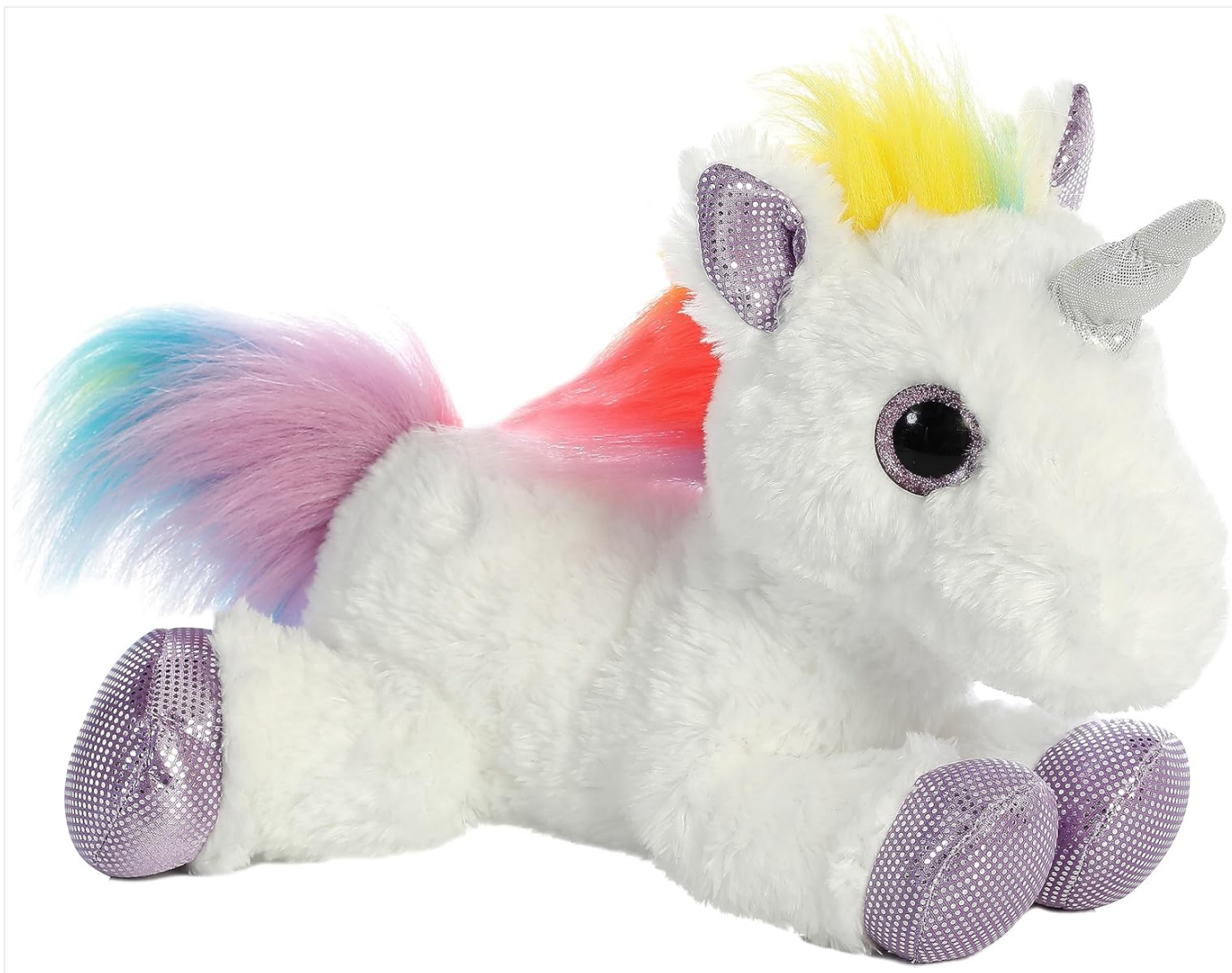
Image: The Aurora Rainbow Unicorn in a sitting position, showcasing its design.