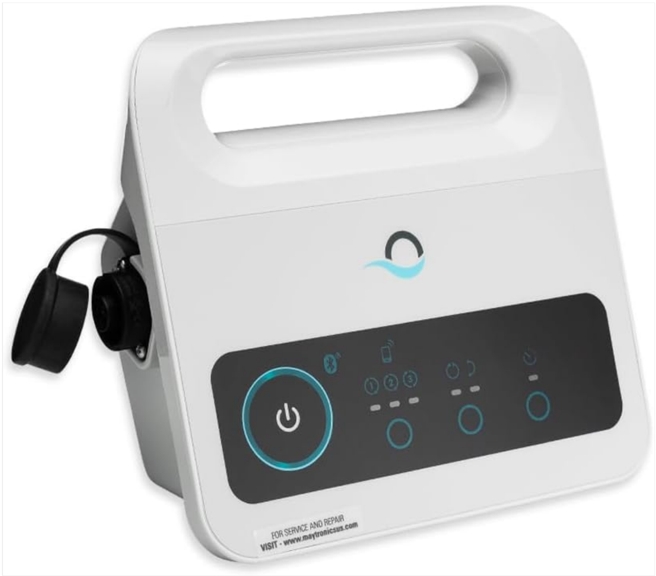
Image: The Dolphin Maytronics Power Supply 99956035, a white unit with a handle and a black control panel featuring a large power button and several indicator lights.