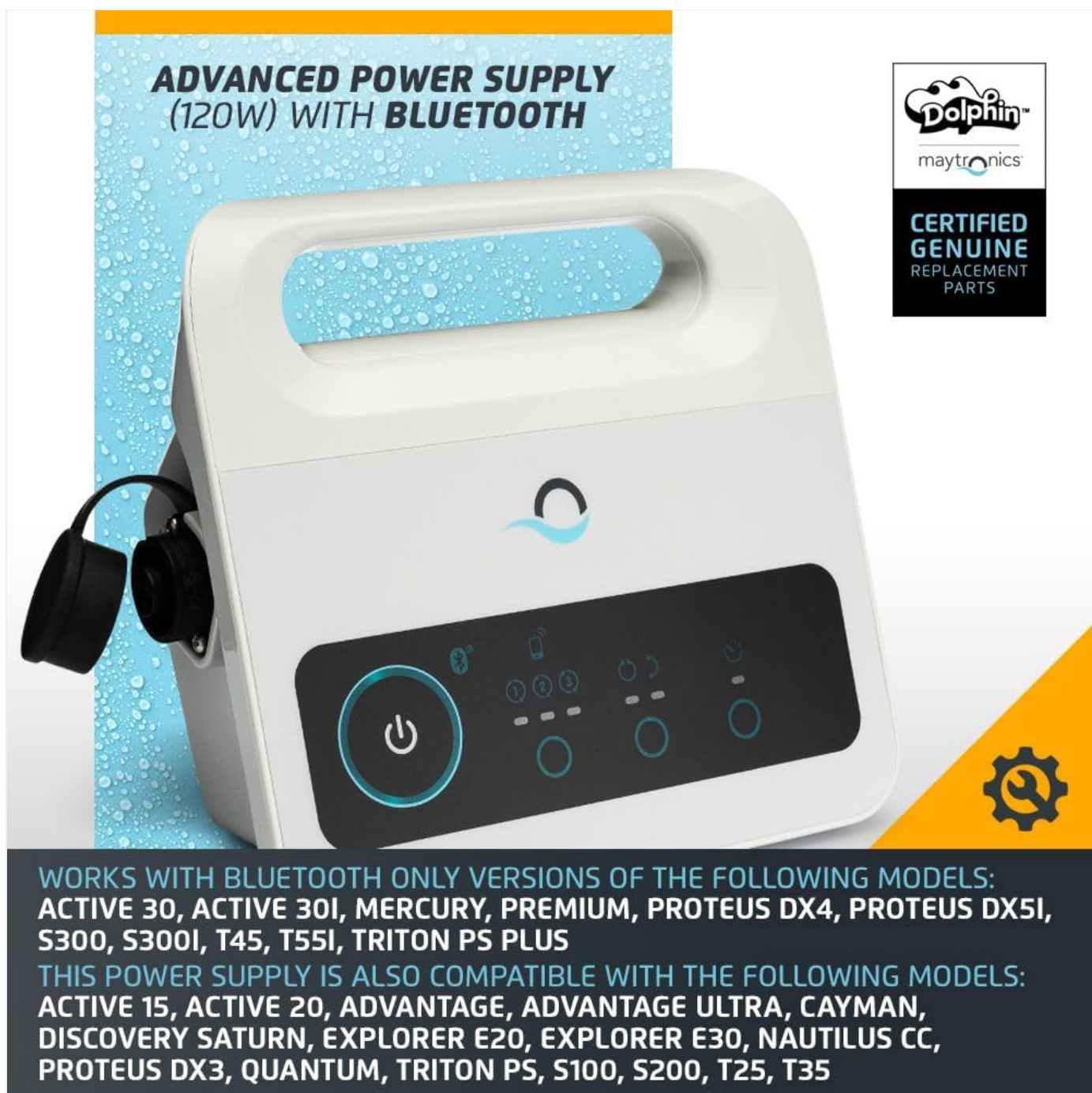
Image: The power supply unit highlighting its Bluetooth capability and listing various compatible Dolphin pool cleaner models.