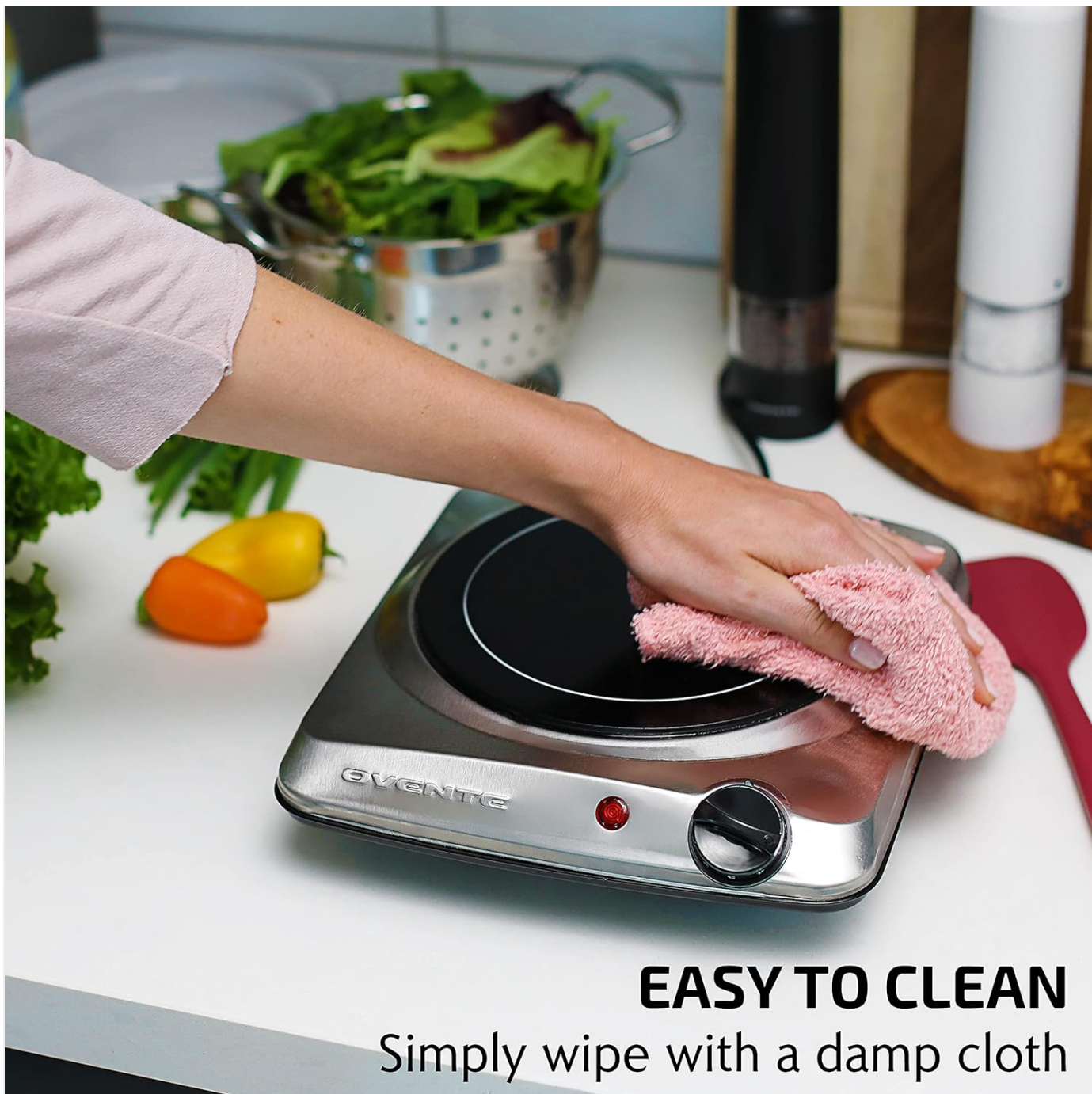
Image: A hand wiping the surface of the OVENTE burner with a soft pink cloth, demonstrating the ease of cleaning.