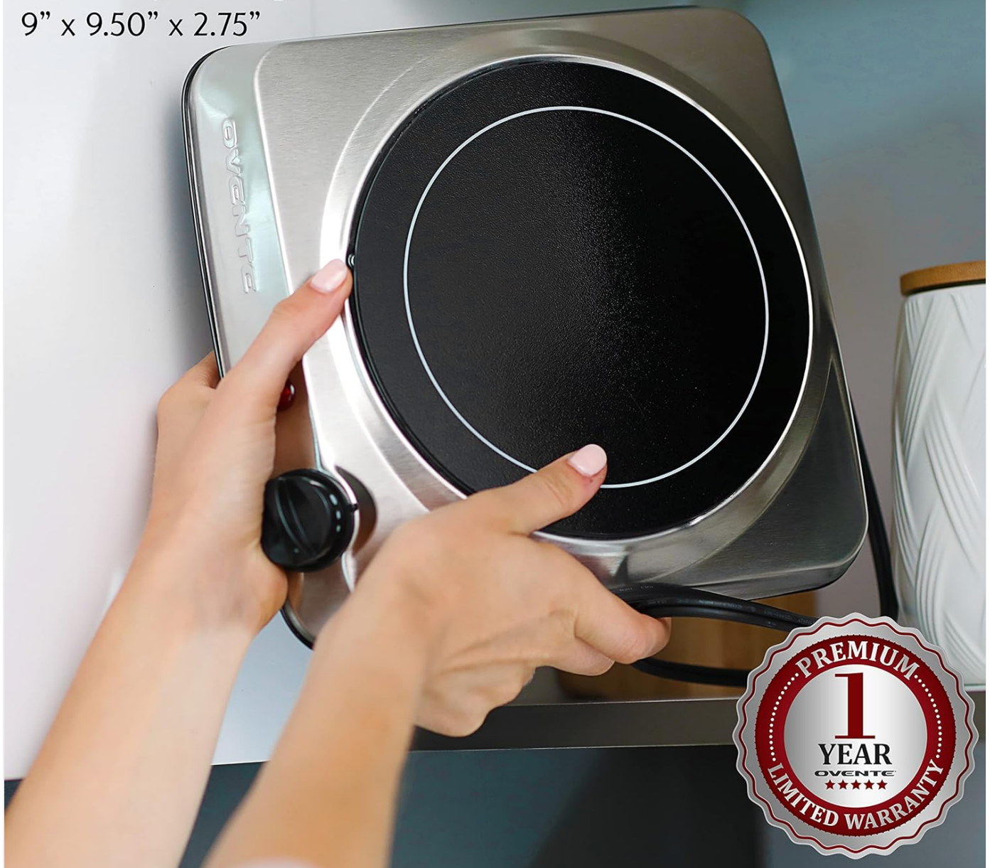
Image: A person demonstrating the compact size of the burner by easily placing it into a kitchen cabinet, highlighting its lightweight and portable nature.