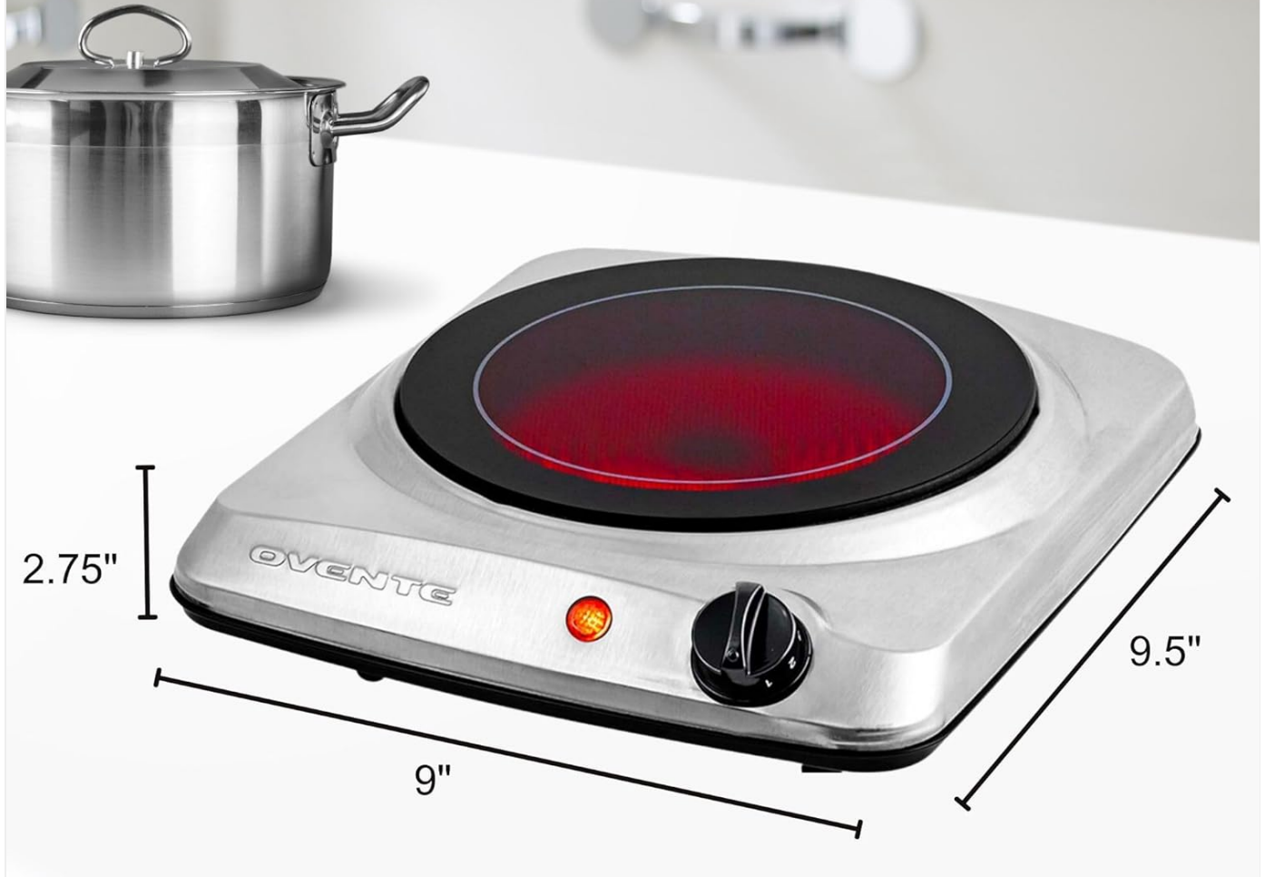
Image: The burner with dimensions labeled (9.5"D x 9"W x 2.75"H) and text indicating versatility with various cookware types like stainless steel, ceramic, and cast iron.

Works with virtually all cookware; stainless steel, ceramic, cast iron and more.