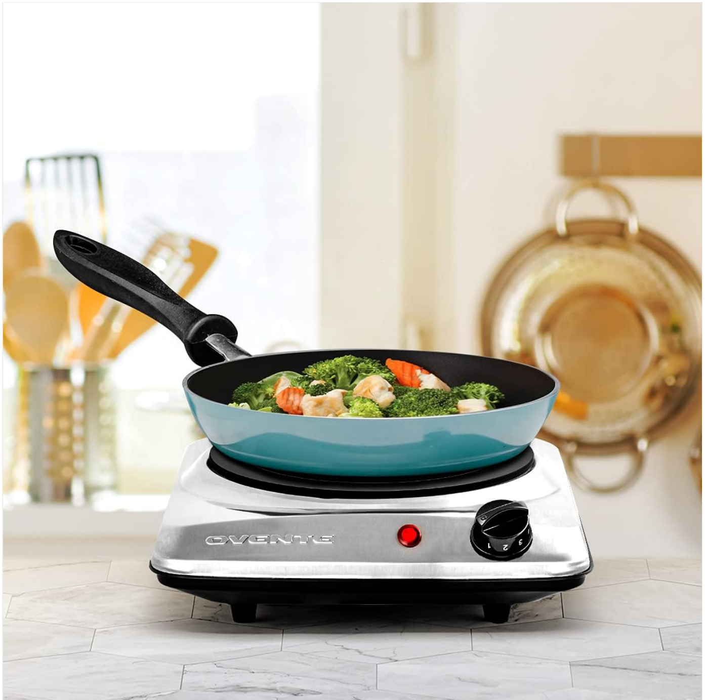
Image: The OVENTE burner in use with a frying pan containing broccoli and shrimp, demonstrating its cooking capability.