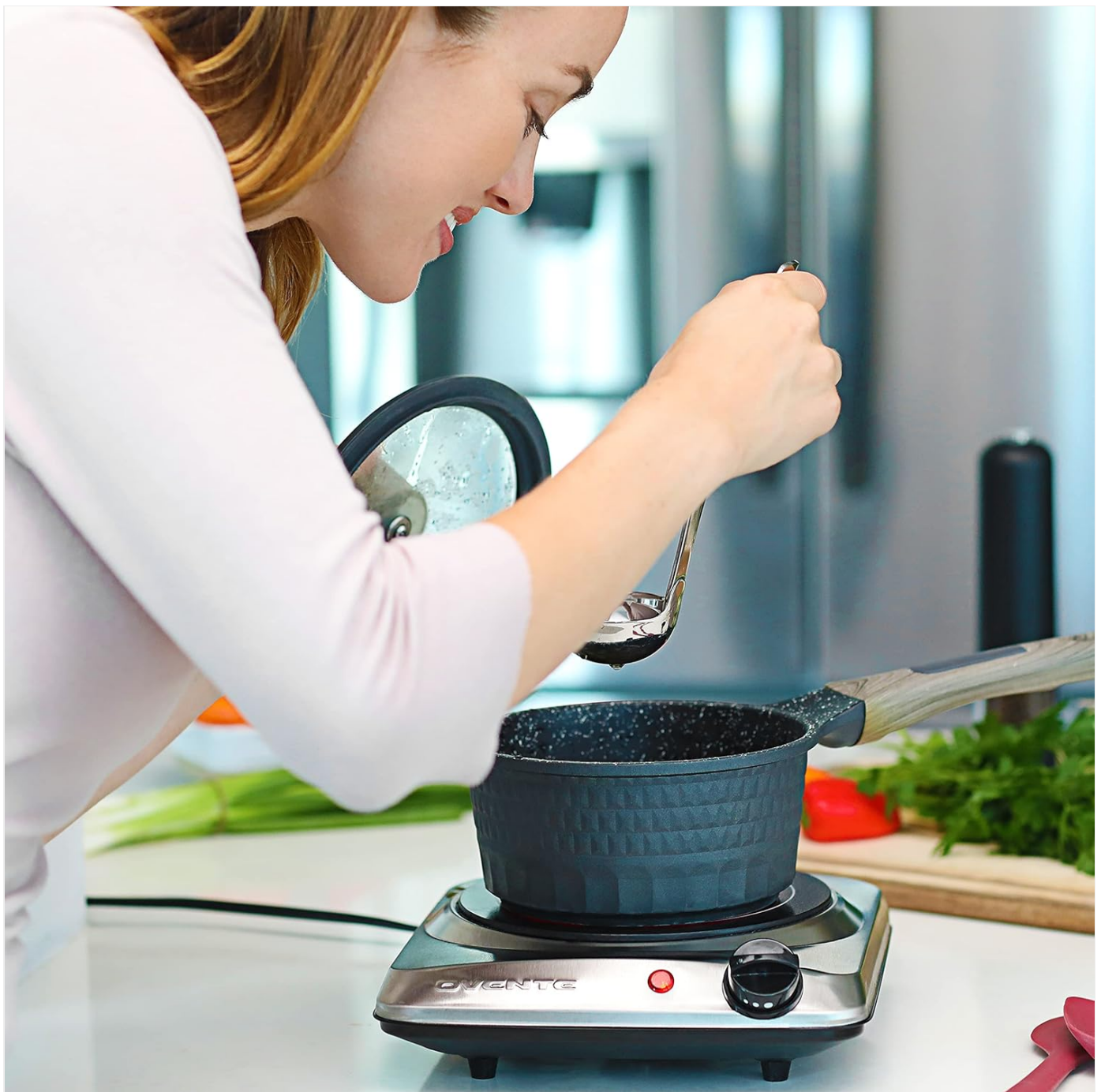
Image: A woman stirring contents in a pot placed on the OVENTE burner, illustrating its use for various cooking methods.