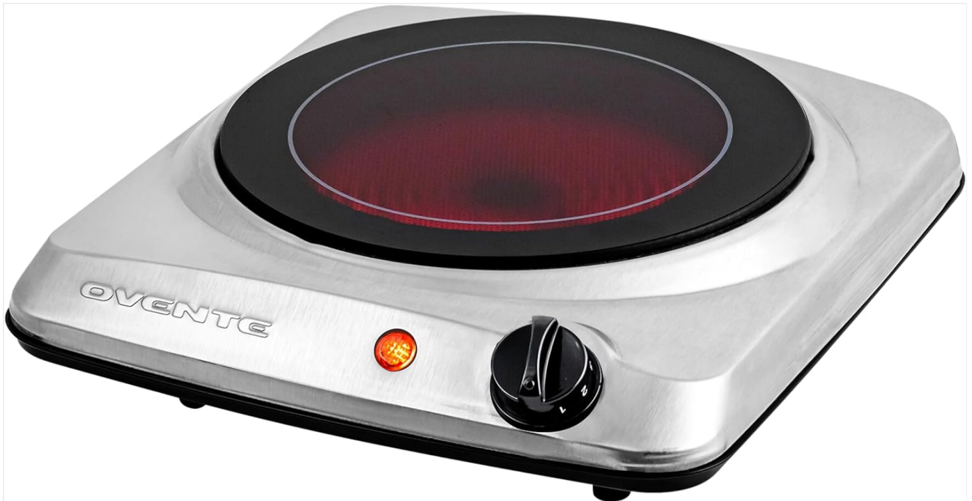
Image: The OVENTE Countertop Infrared Single Burner, a compact silver unit with a black ceramic glass cooktop and a control knob.

Thank you for purchasing the OVENTE Countertop Infrared Single Burner, Model BGI101S. This electric hot plate is designed for efficient and convenient cooking, featuring infrared technology for quick and even heating. Its compact and portable design makes it ideal for various settings, including homes, dorms, offices, and travel. Please read this manual thoroughly before use to ensure safe and optimal performance of your appliance.