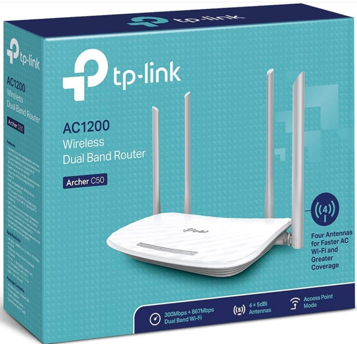
Figure 2: Archer C50 Retail Packaging

The router and its accessories are securely packaged within the retail box, which highlights key features such as AC1200 Wi-Fi and four antennas.