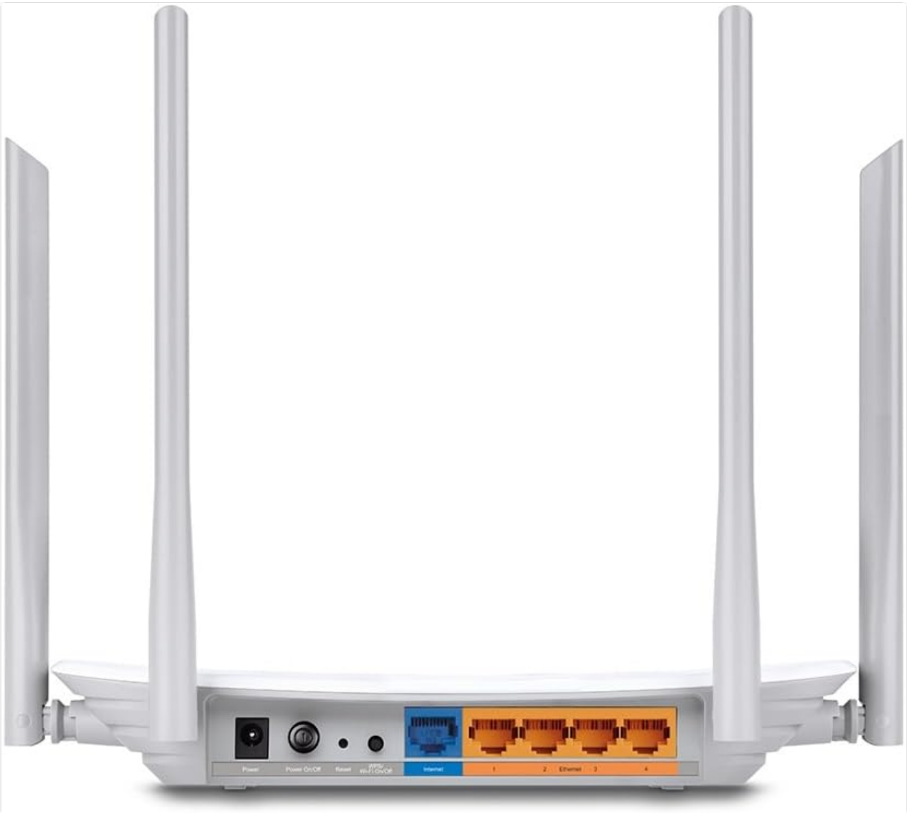
Figure 3: Archer C50 Rear Panel

The rear panel includes the power input, Power On/Off button, Reset button, Wi-Fi On/Off button, WPS button, WAN (Internet) port, and four LAN (Ethernet) ports.