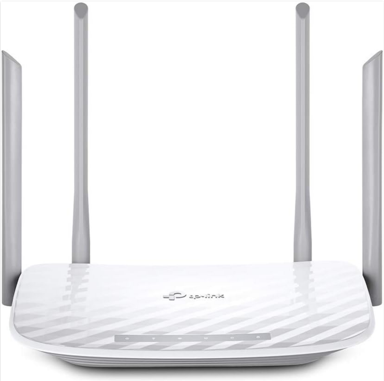
Figure 1: TP-Link Archer C50 AC1200 Wireless Dual Band Router (Front View)

The Archer C50 router features a sleek white and gray design with four external antennas for enhanced wireless coverage. The front panel includes LED indicators for power, system status, Wi-Fi bands, and Ethernet port activity.