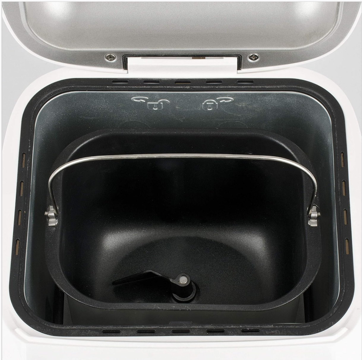
Image: A detailed view of the interior of the bread pan, showing the non-stick coating and the kneading paddle securely in place at the bottom.