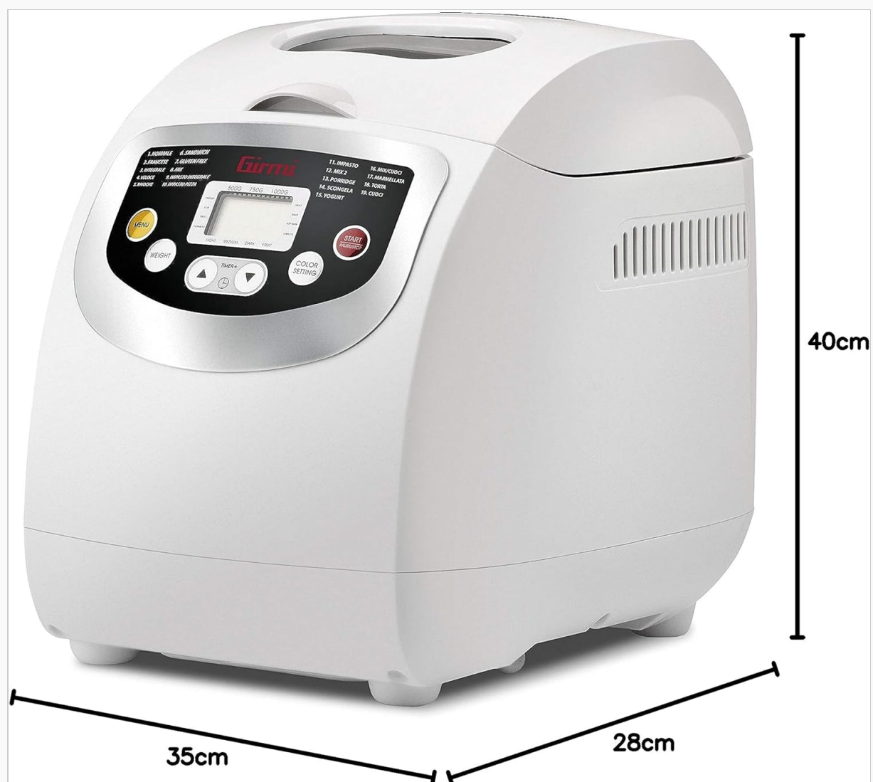
Image: A diagram illustrating the dimensions of the Girmi MP2000 bread maker, showing a width of 35cm, a depth of 28cm, and a height of 40cm.