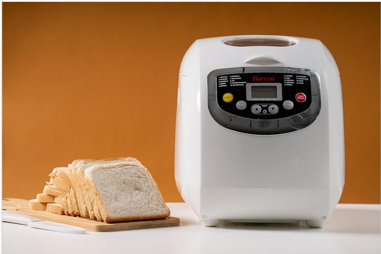
Image: A close-up of the electronic control panel, featuring the LCD screen, 'MENU', 'WEIGHT', 'COLOR SETTING', 'TIMER', and 'START/STOP' buttons, along with a list of programs.