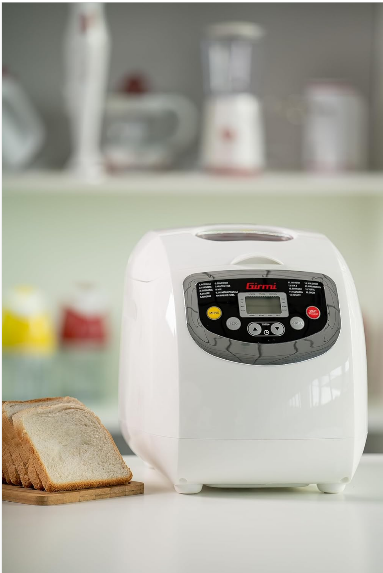
Image: The Girmi MP2000 bread maker positioned on a kitchen counter, showcasing its compact design. A cutting board with freshly sliced bread is placed beside it.