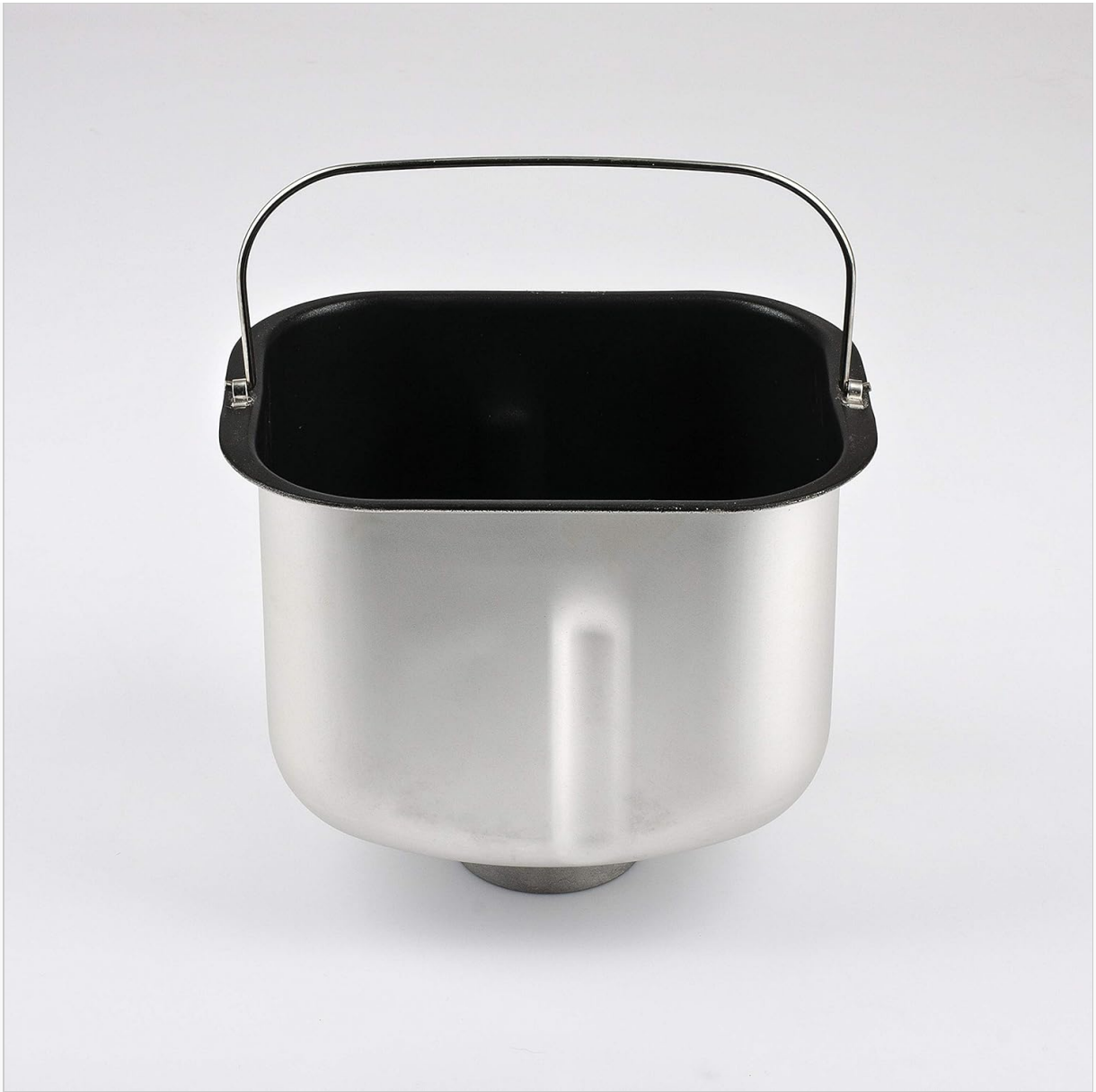
Image: The removable bread pan with its handle, designed for easy insertion and removal from the bread maker.