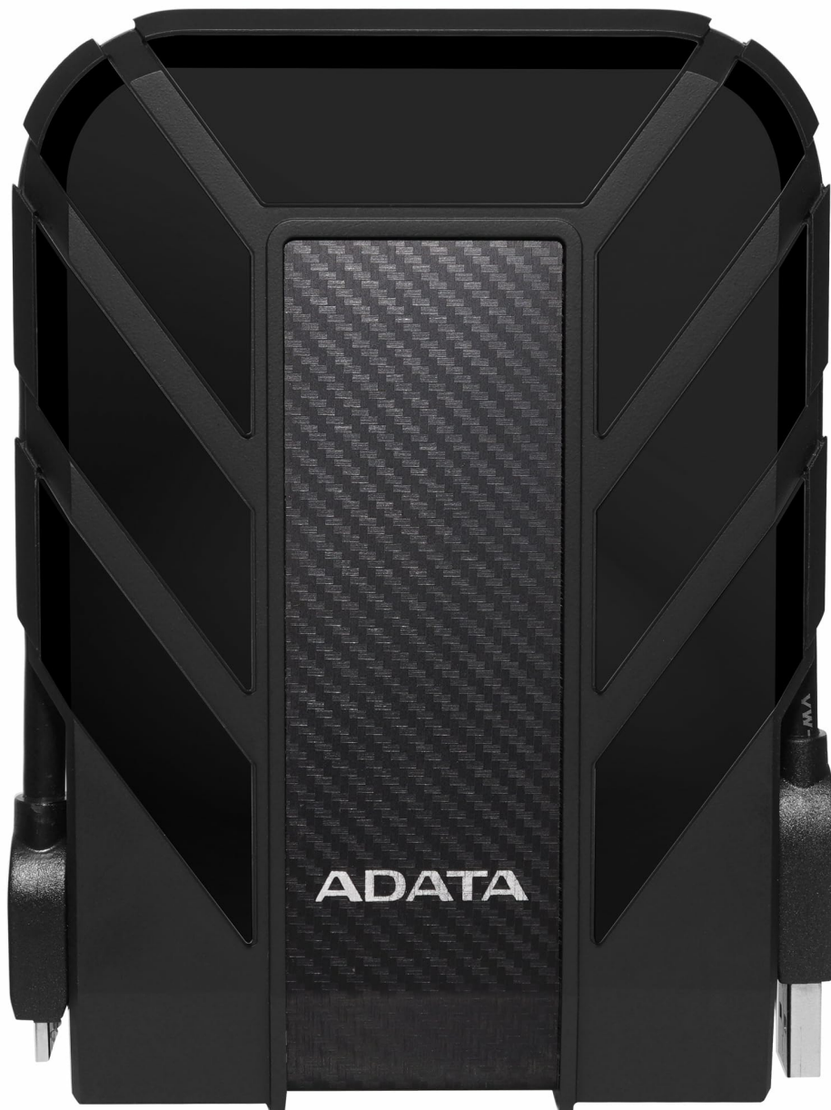
Figure 1: ADATA HD710 Pro 1TB External Hard Drive (Black)