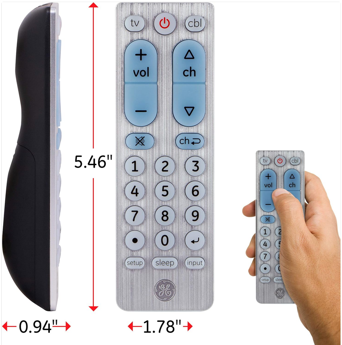
Image: A diagram showing the physical dimensions of the remote control: 5.46 inches in length, 1.78 inches in width, and 0.94 inches in thickness. A hand holding the remote is also shown for scale.