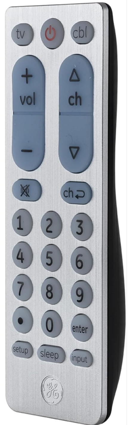
Image: The GE Big Button Universal Remote Control shown alongside its product packaging, highlighting its key features and design.