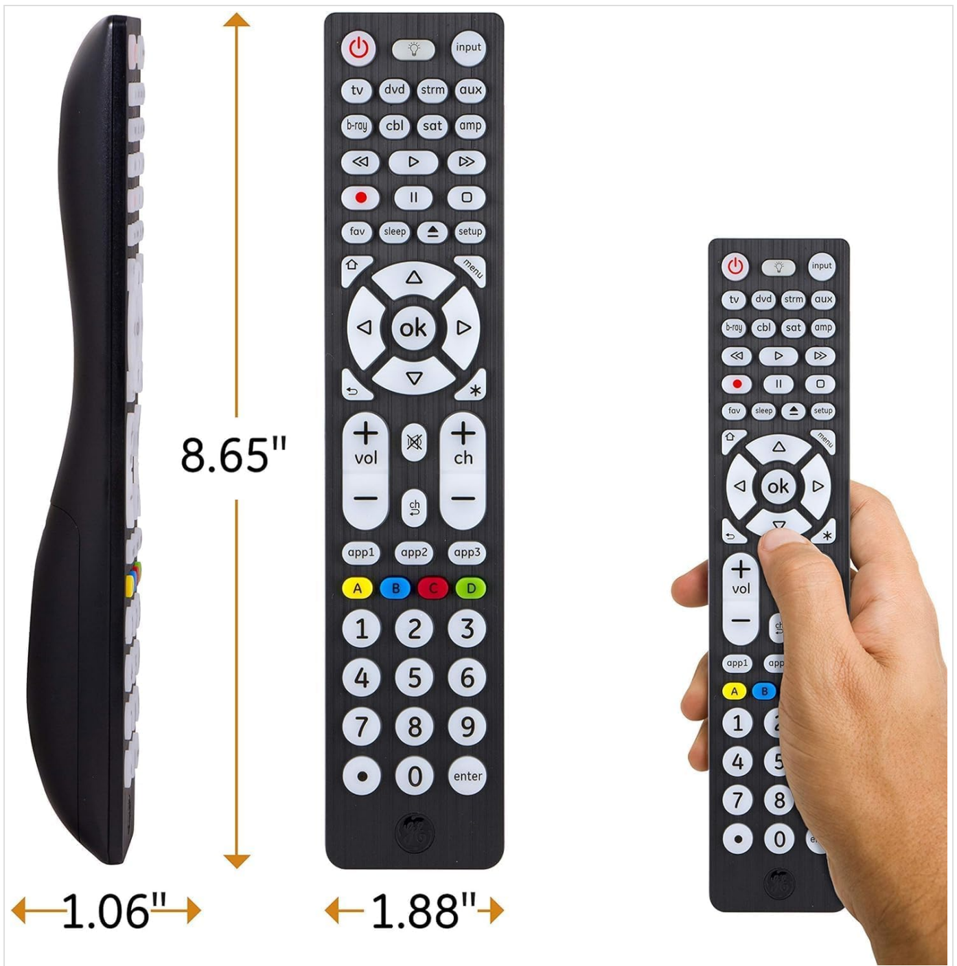
Figure 3: Remote Control Dimensions