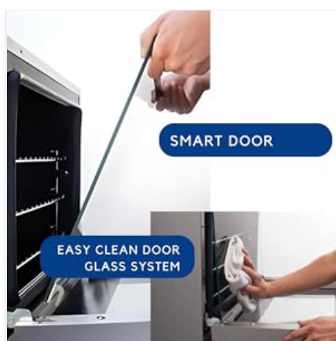
Image: A hand removing the inner glass panel of the oven door for cleaning, highlighting the 'Smart Door' feature.