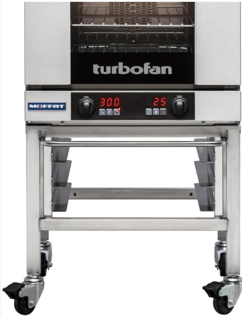
Image: The Moffat Turbofan E23D3/2C-208V Double Stack Convection Oven with Casters, showcasing its full size and stainless steel construction.