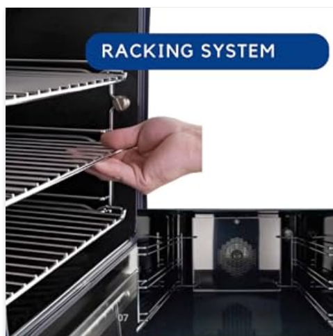
Image: A hand demonstrating the anti-withdraw, anti-tilt racking system with telescopic reach.