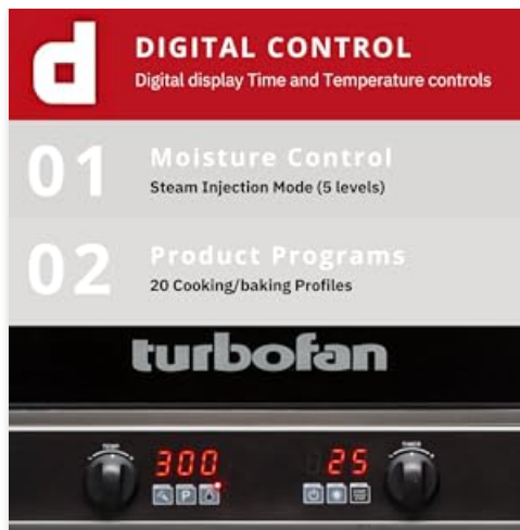
Image: Close-up of the digital control panel, showing temperature and timer displays, and control knobs.

The oven features a digital display for precise control over temperature and time. It also includes 20 programmable cooking/baking profiles and a 5-level steam injection mode for moisture control.