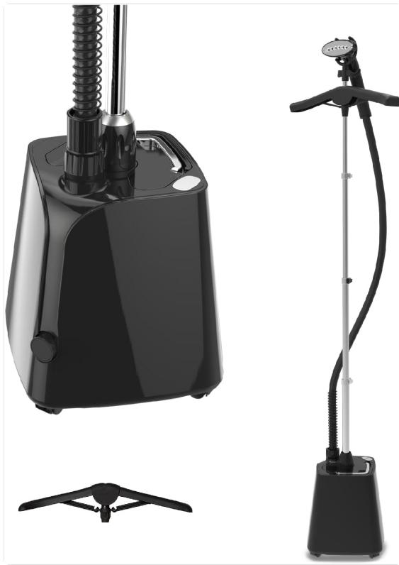
The SteamOne H18B Vertical Garment Steamer, fully assembled.