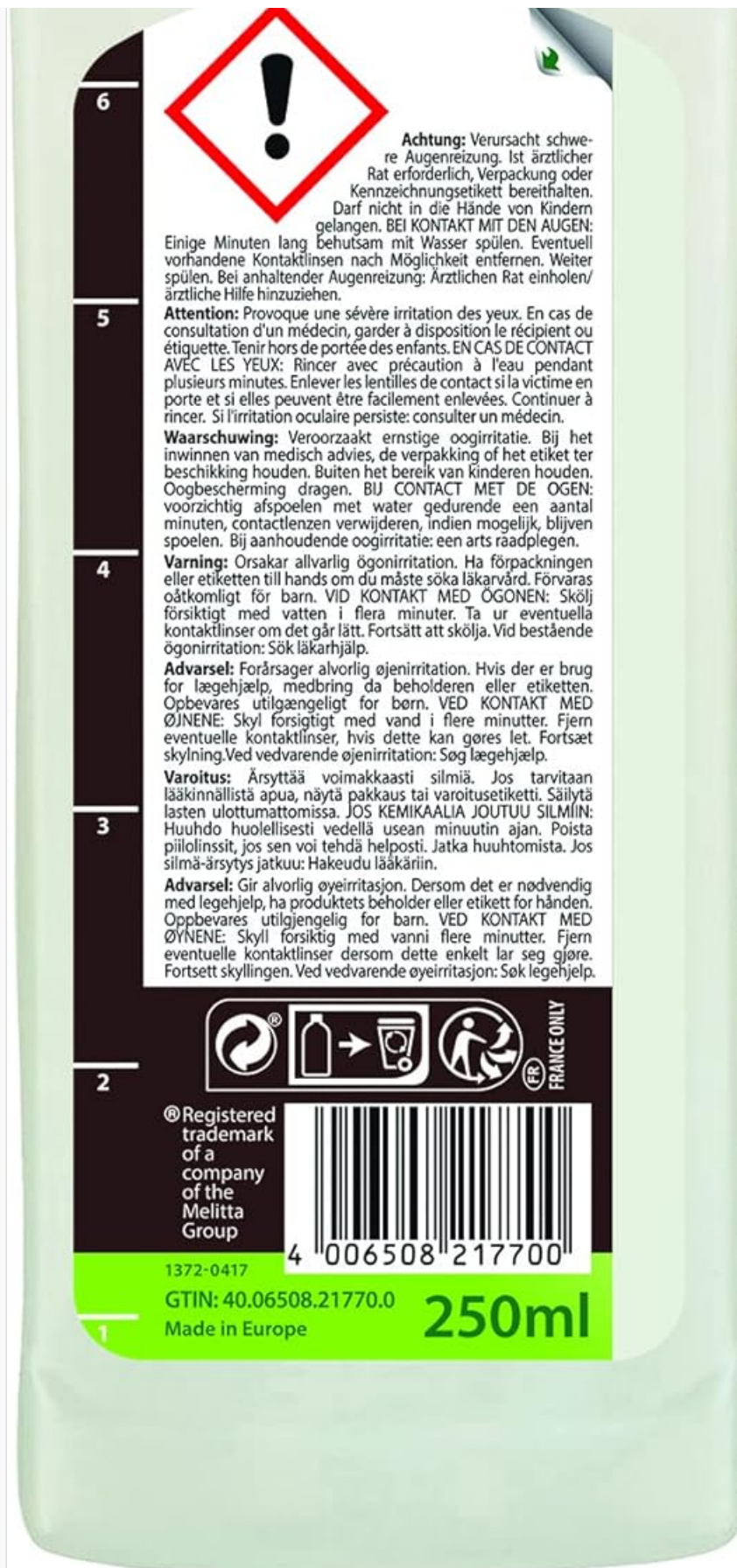
Image: Back label of the Melitta descaler bottle, displaying safety warnings and instructions in multiple languages.