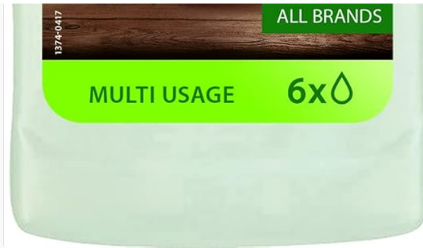
Image: Front view of the Melitta Anti Calc Bio Liquid descaler bottle, highlighting its organic composition and multi-usage capability.

The Melitta Premium Organic Bio Liquid Descaler is formulated with citric acid, which is already dissolved for immediate use. It is designed for compatibility with various coffee machines, including those from Nespresso, Delonghi, and Jura, as well as kettles and other automatic coffee machines.