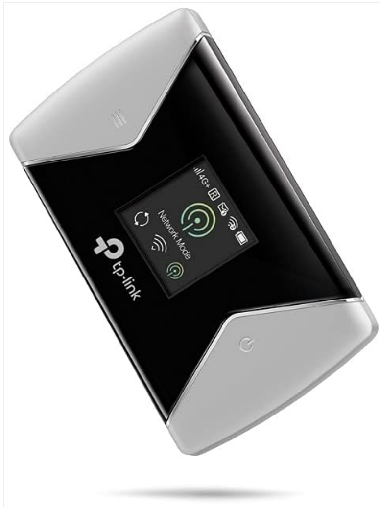
Figure 3.2: Angled view of the TP-Link M7450, highlighting the screen and the power button on the right side.