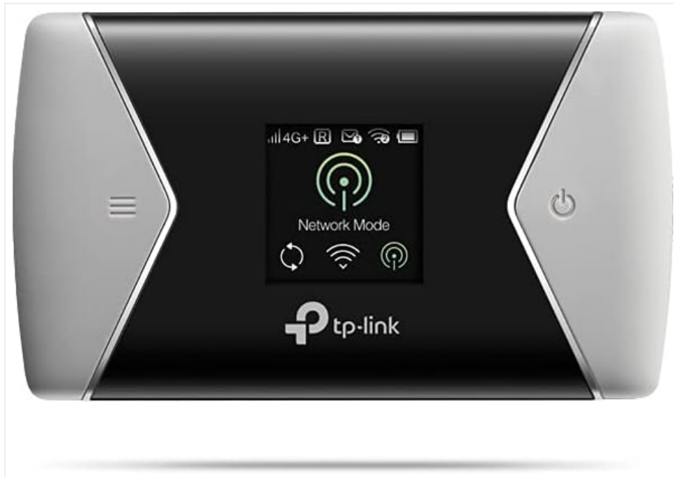
Figure 3.1: Front view of the TP-Link M7450 Mobile Wi-Fi, showing the screen with network mode, signal strength, battery, and Wi-Fi status indicators.

The TP-Link M7450 features a compact design with an integrated screen for easy monitoring of device status.