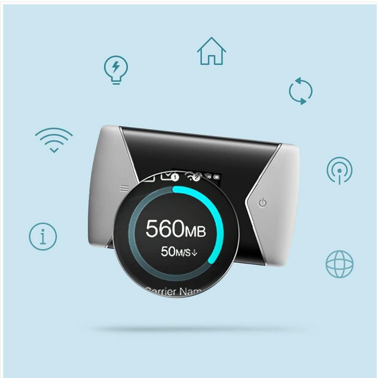
Figure 3.3: Close-up of the M7450 screen showing data usage information, indicating 560MB used.