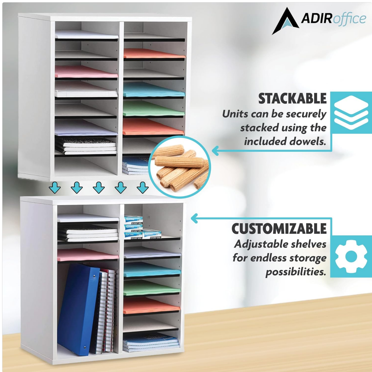
Image 5.1: Demonstrates the stackable and customizable features of the organizer.