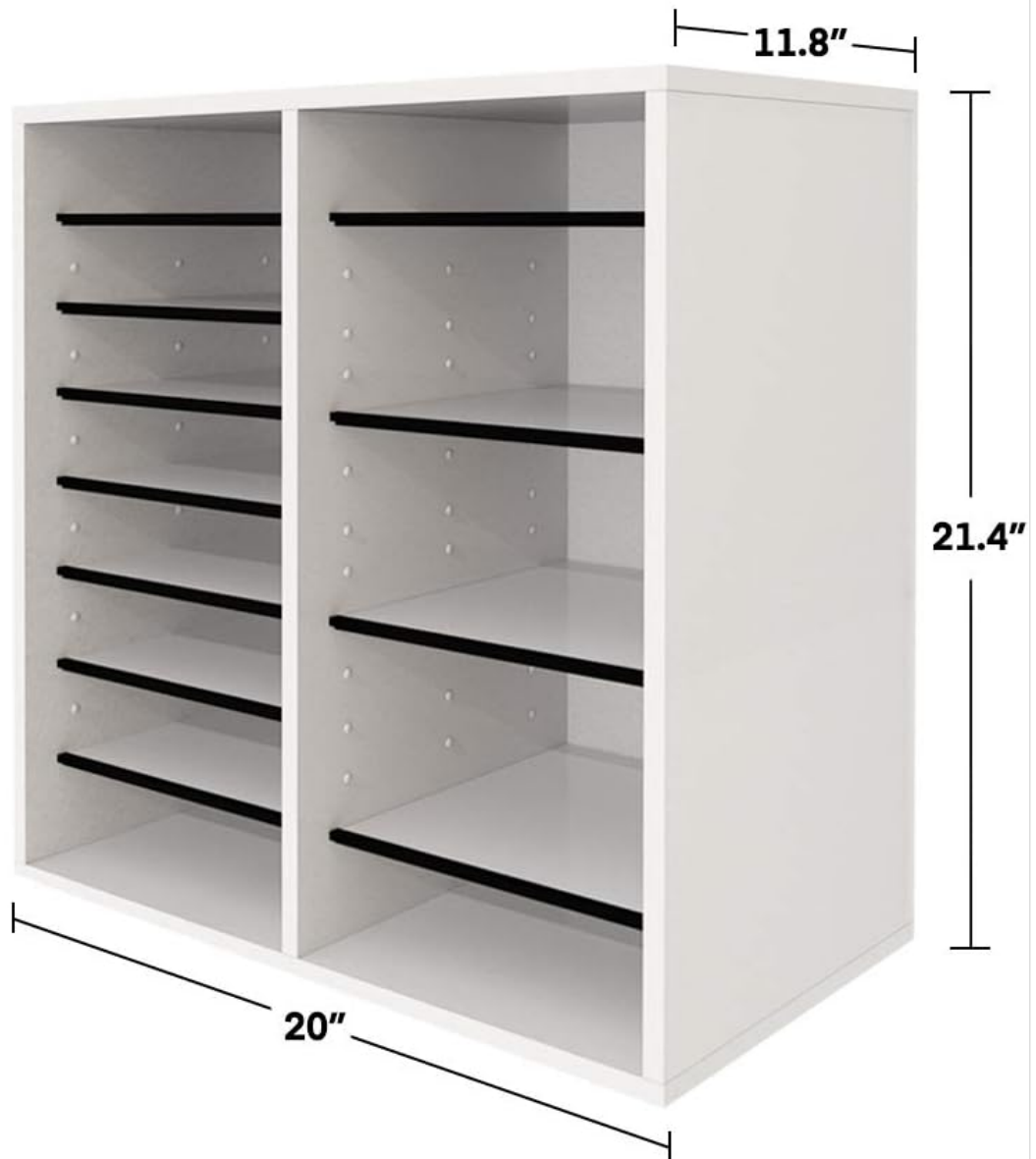
Image 8.1: Product dimensions for the AdirOffice Literature Organizer.