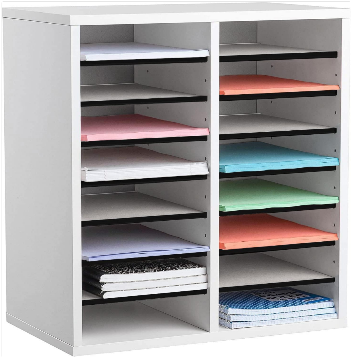
Image 1.1: The AdirOffice 16-Compartment Literature Organizer in white, shown filled with sorted documents.