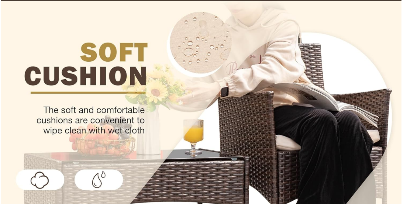
Image: Ergonomic design and soft, easy-to-clean cushions provide a comfortable sitting experience.

The soft and comfortable cushions are convenient to wipe clean with wet cloth