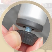
Upgrade Anti-slip Chair Feet