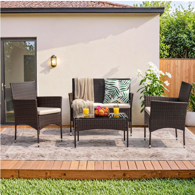
Image: The set is versatile for various outdoor settings, including lawns and gardens.