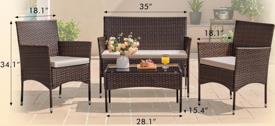
Image: Detailed product dimensions for the single chair, double chair, and table.