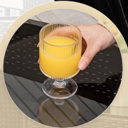
Tempered Glass On Top