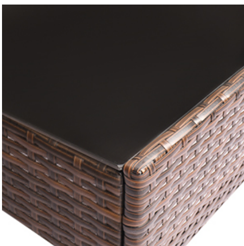
Image: Detailed view of the waterproof PE rattan material.

Image: Ergonomic design and soft, easy-to-clean cushions provide a comfortable sitting experience.