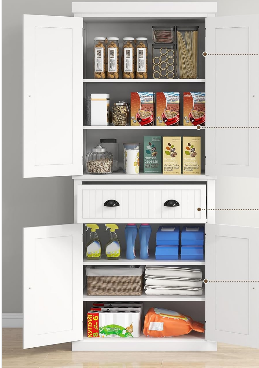
Image: Spacious interior of the HOMCOM pantry cabinet, demonstrating its capacity for various kitchen supplies.

Fits small appliances, storage baskets, or more