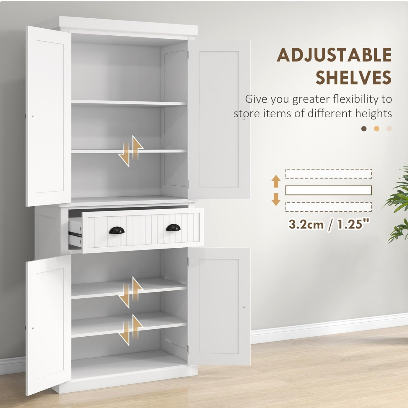
Image: Detail of the adjustable shelves within the cabinet, highlighting the flexibility for different item heights.