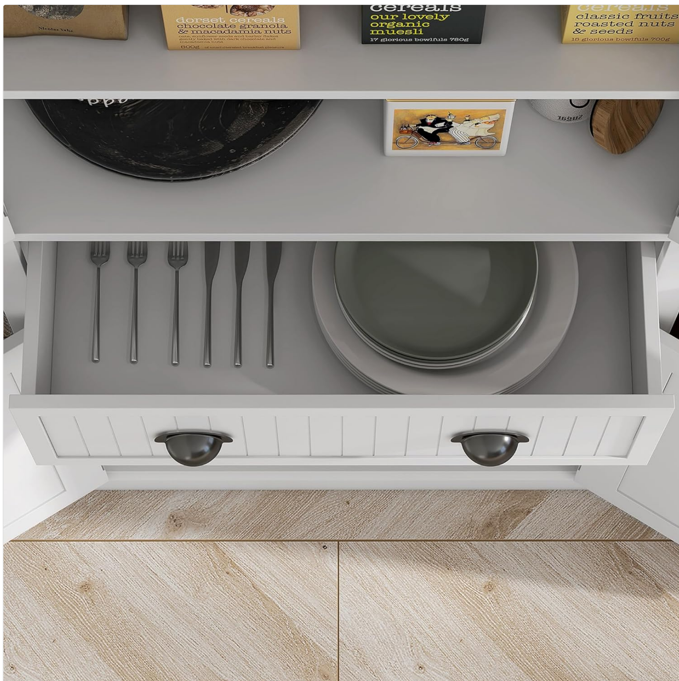
Image: The spacious drawer, suitable for organizing cutlery and other small kitchen items.