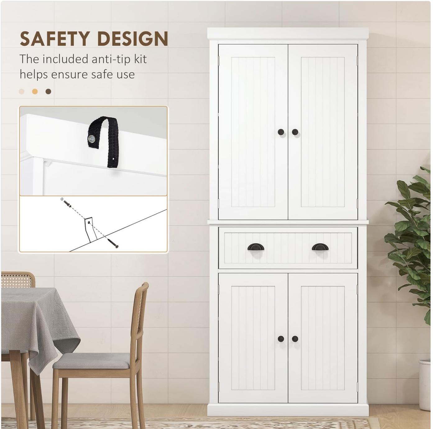
Image: Illustration of the safety design, showing the anti-tip kit for secure wall attachment.