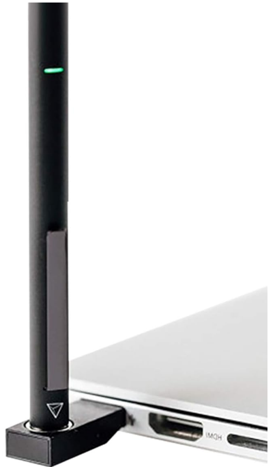
Image 3.2: The Adonit Dash 3 stylus connected to its magnetic USB charger, plugged into a laptop.

Sketch with Dash 3 for up to 14 hours of continuous use - recharge in just 45 minutes.