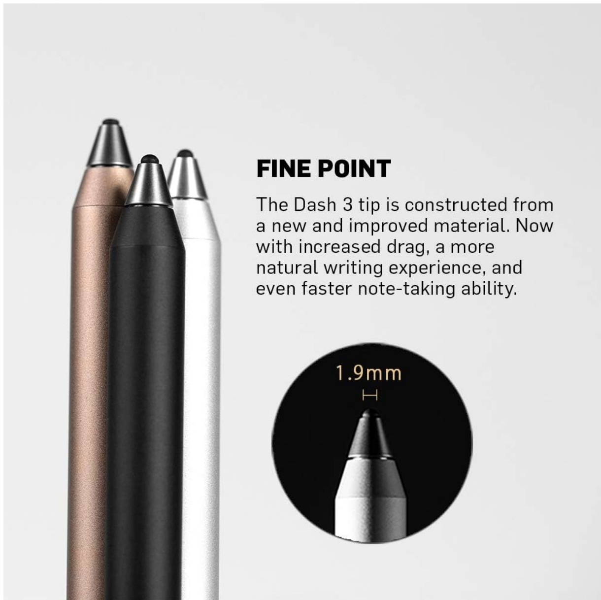
Image 4.1: The fine 1.9mm PixelPoint tip of the Adonit Dash 3 stylus.