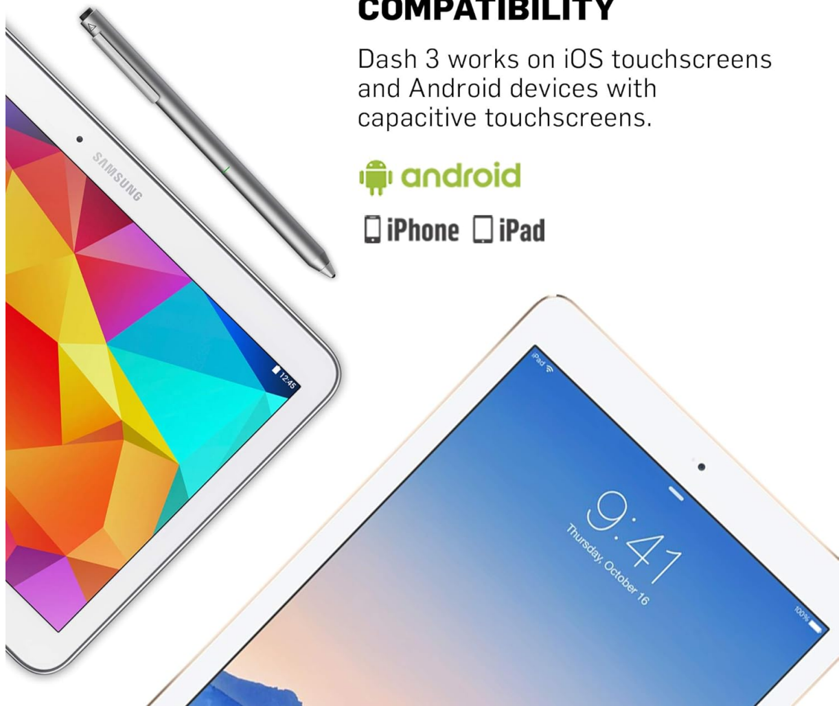
Image 6.1: The Adonit Dash 3 stylus demonstrating compatibility with both Android and iOS tablets.