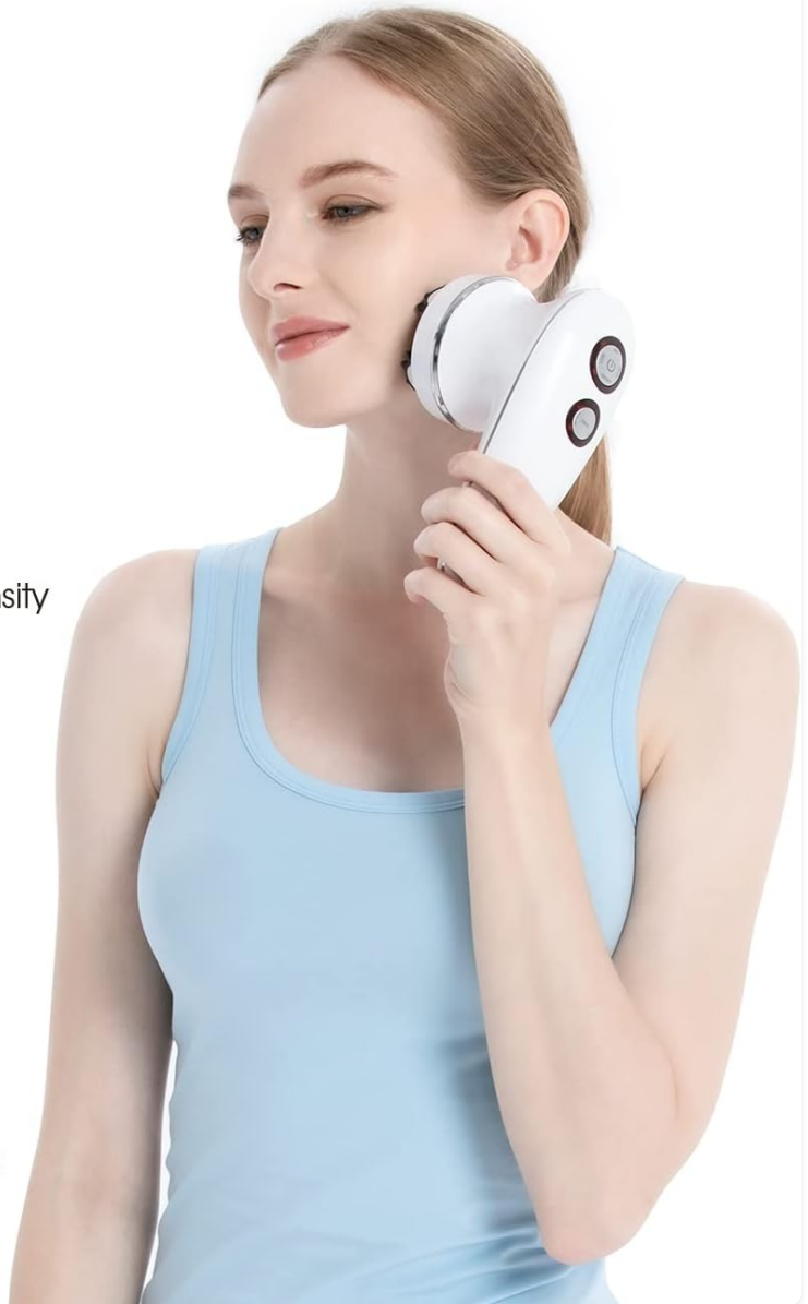
Figure 3.1: Overview of the massager's multi-functional features.