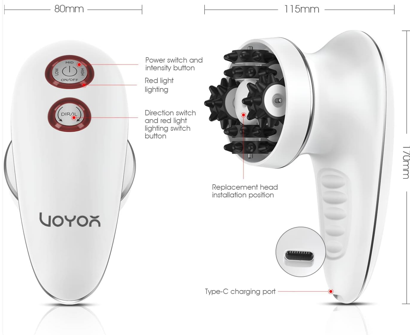
Figure 5.1: Control buttons and their functions.

Let you enjoy a relaxed and healthy life