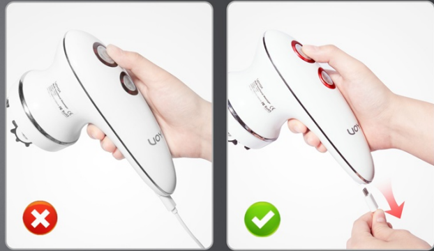
Figure 4.1: Proper charging procedure and caution against operating while charging.