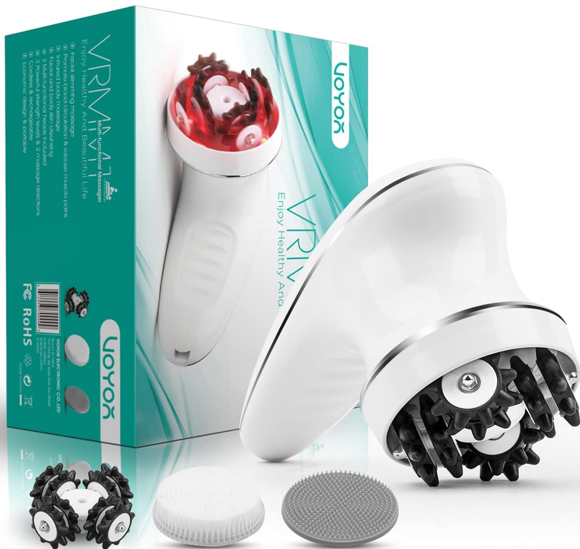
Figure 1.1: VOYOR Electric Cellulite Massager with its packaging and various interchangeable heads.