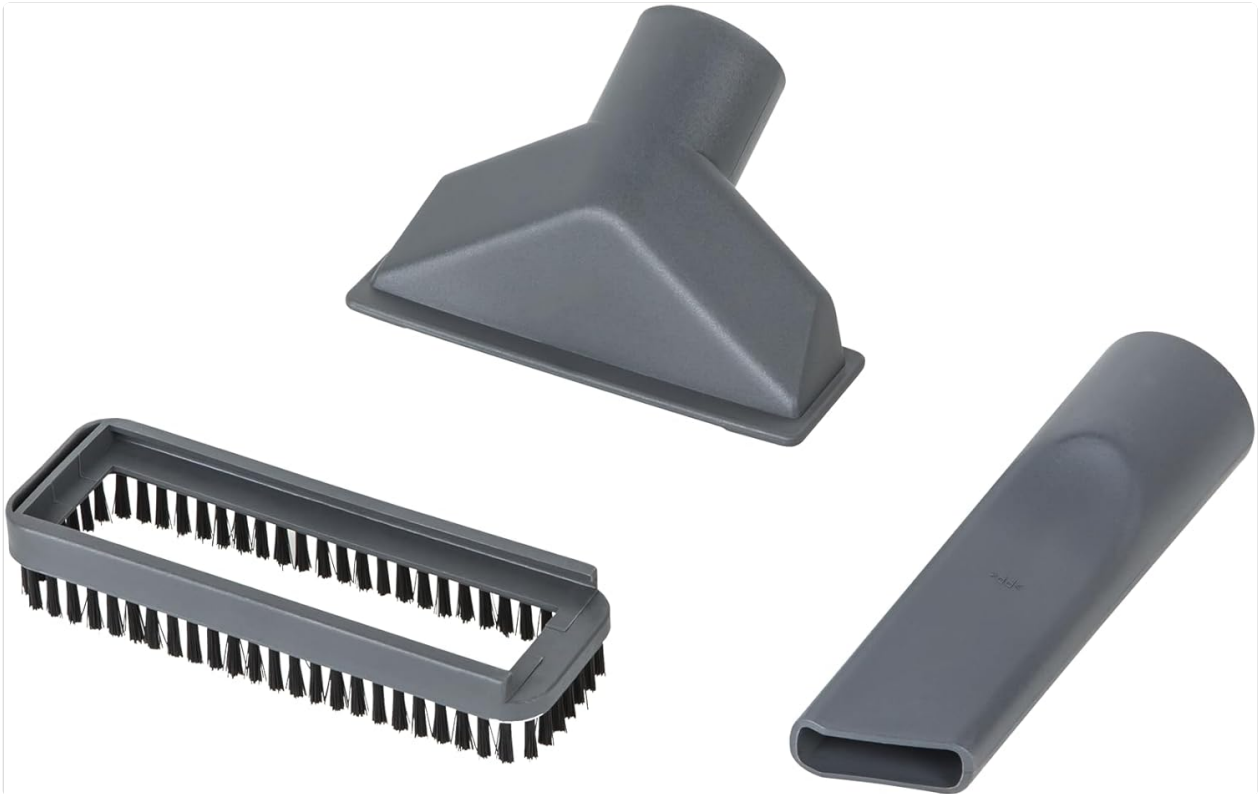
Image 3.1: Included accessories: crevice nozzle, small nozzle, and two-stage floor nozzle.