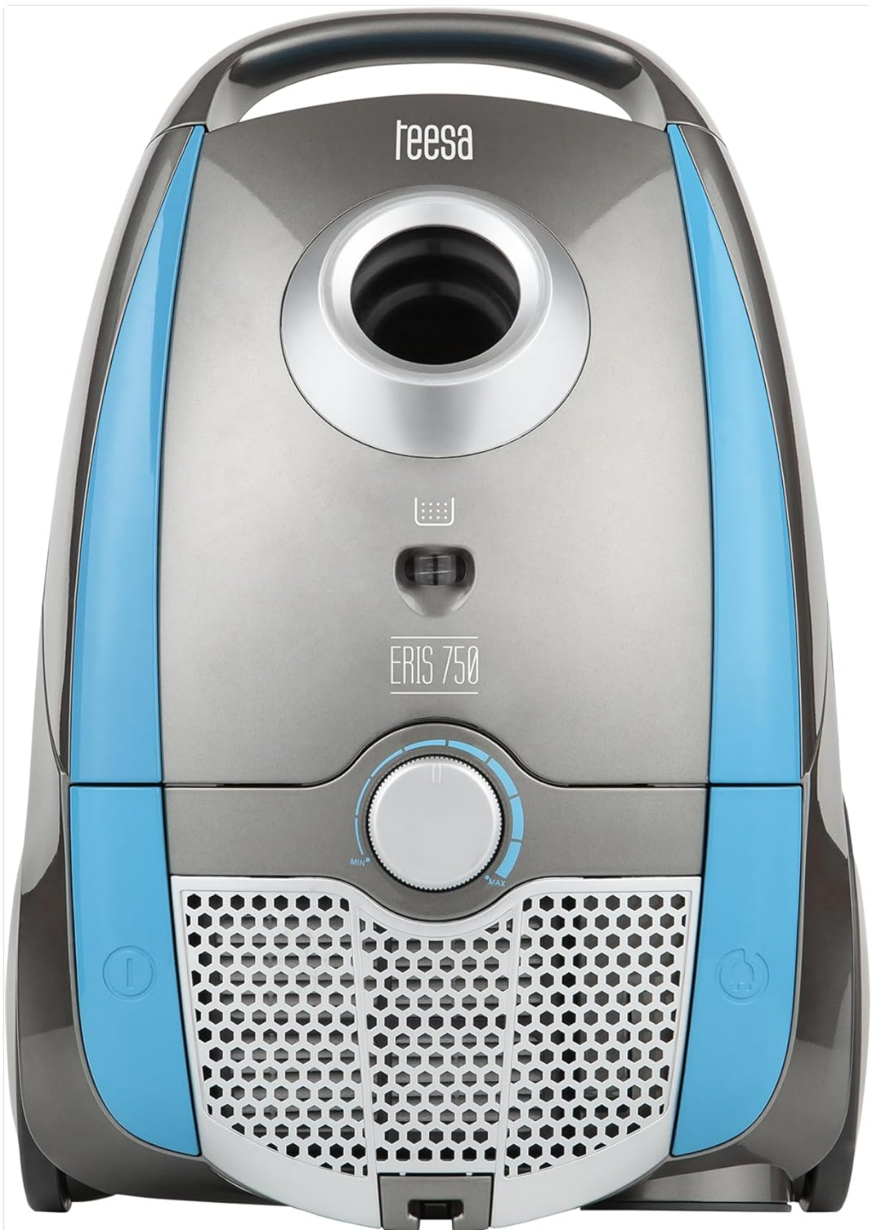
Image 5.1: Top view of the vacuum cleaner showing the power control knob and dust bag full indicator.