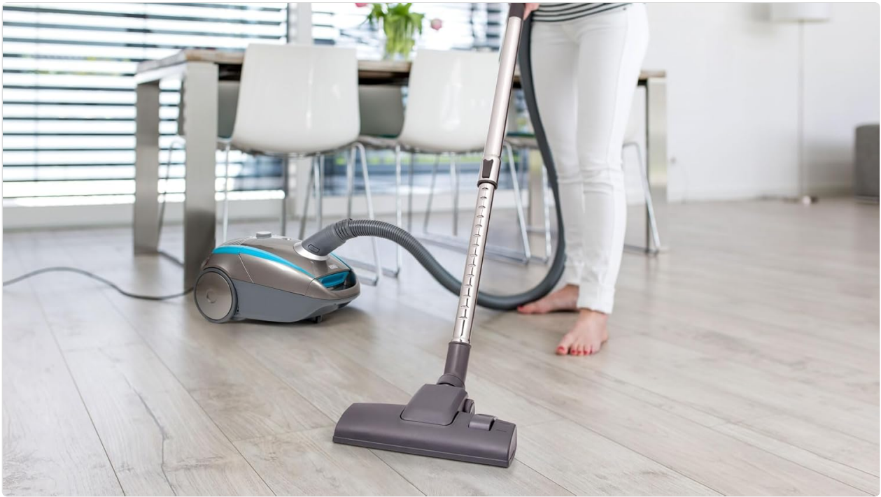
Image 5.2: The Teesa Eris 750 vacuum cleaner being used to clean a hard floor.