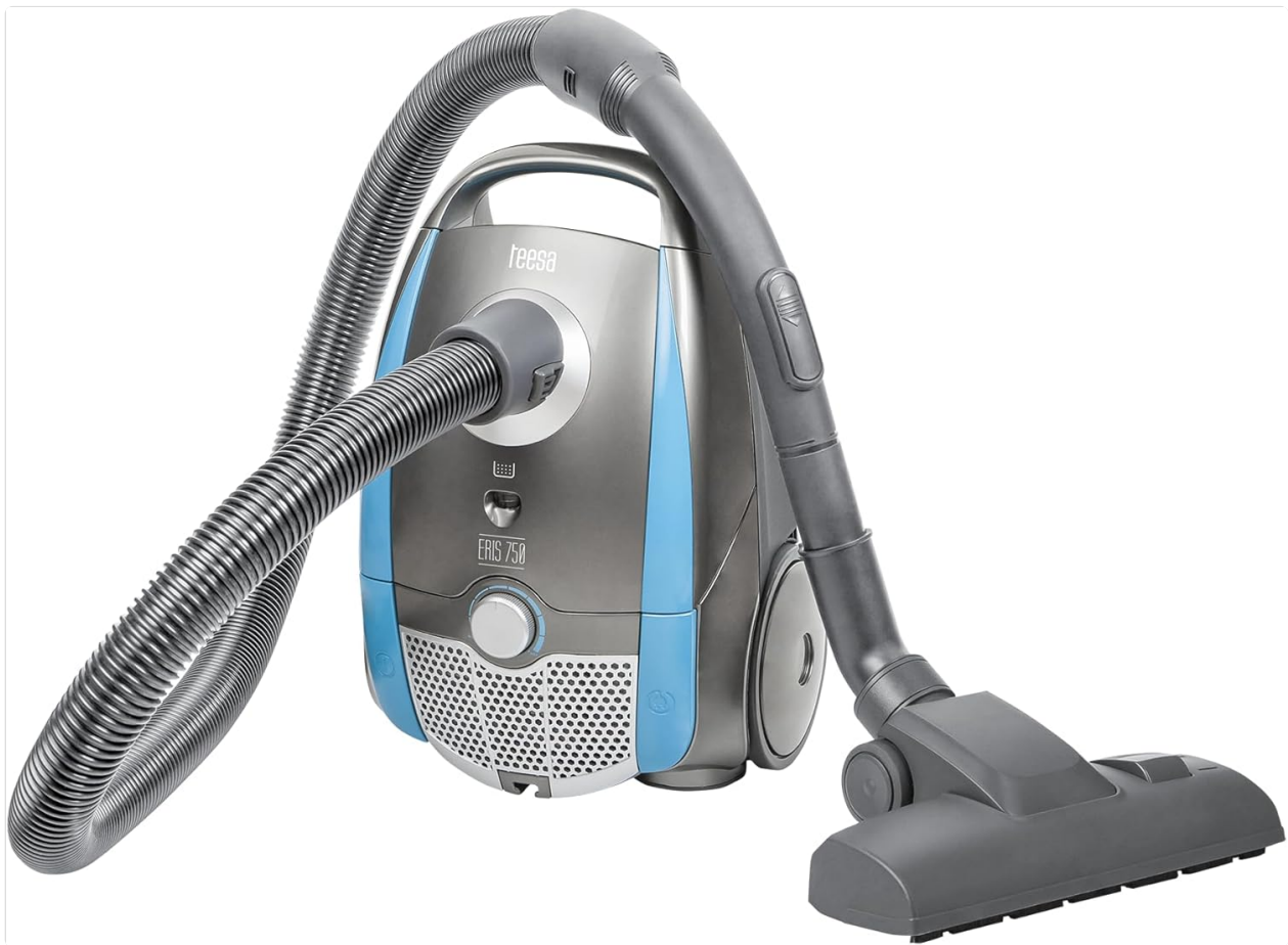
Image 4.1: The vacuum cleaner fully assembled with hose, telescopic tube, and floor nozzle.

directly to the hose handle or the telescopic tube.