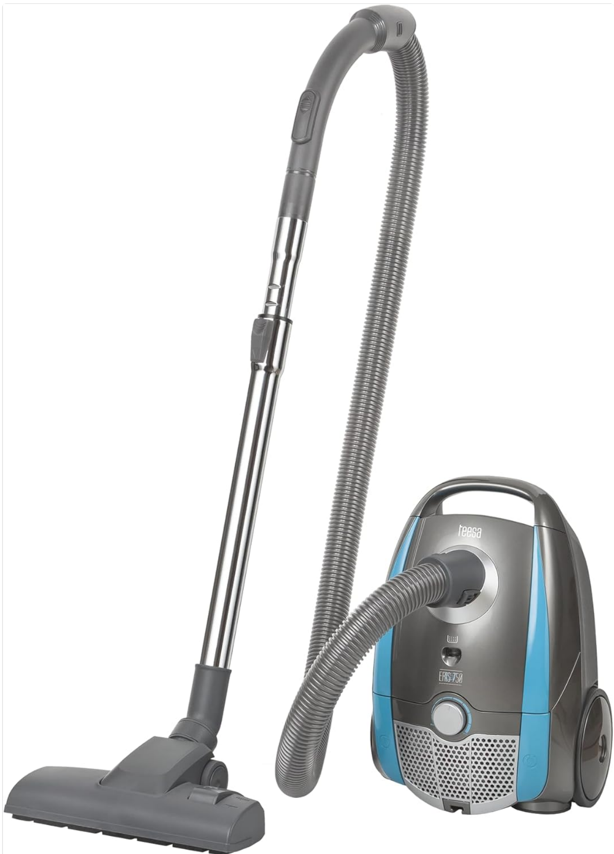
Image 2.1: Teesa Eris 750 Bagged Vacuum Cleaner with hose and floor nozzle.