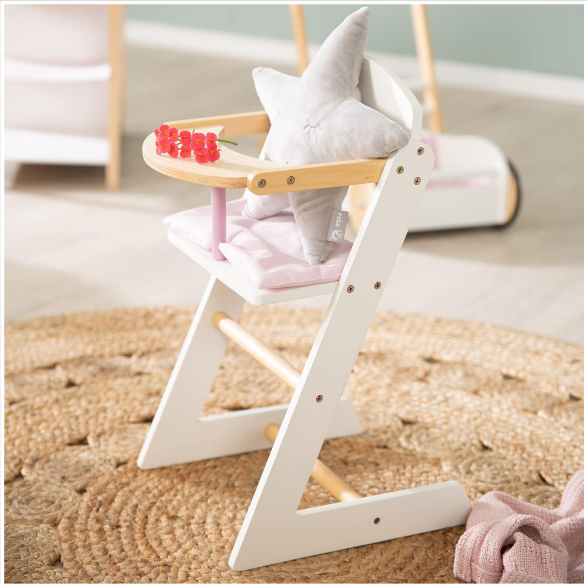
The roba Scarlett Doll High Chair, featuring a white frame, natural wood accents, a pink cushion, and a feeding tray.