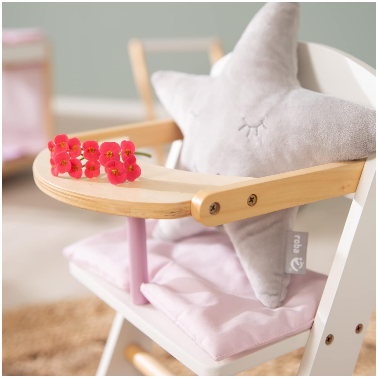
Close-up view of the high chair's feeding tray, suitable for doll accessories.