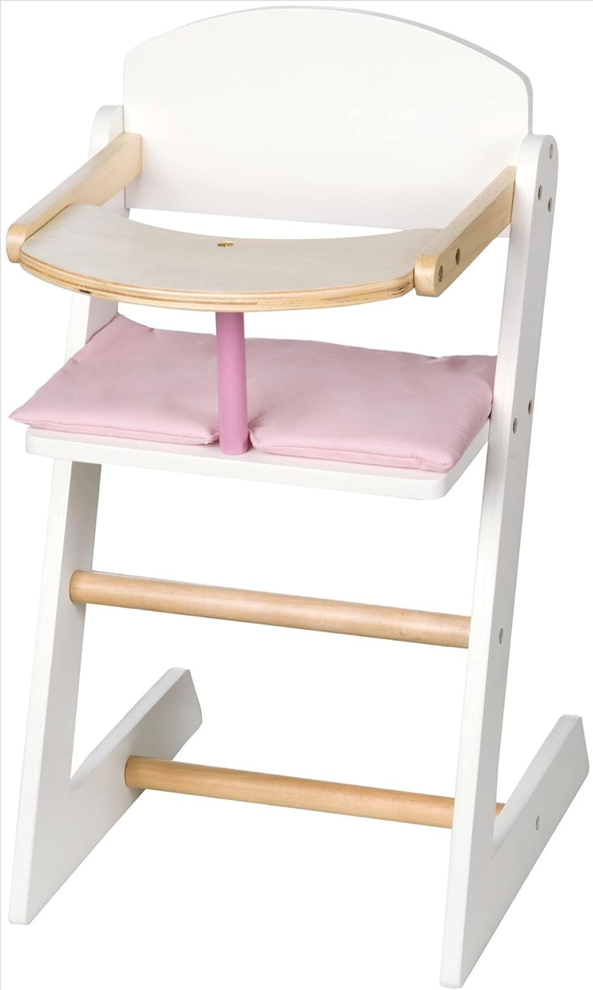
Another view of the doll high chair, highlighting its sturdy construction and design.