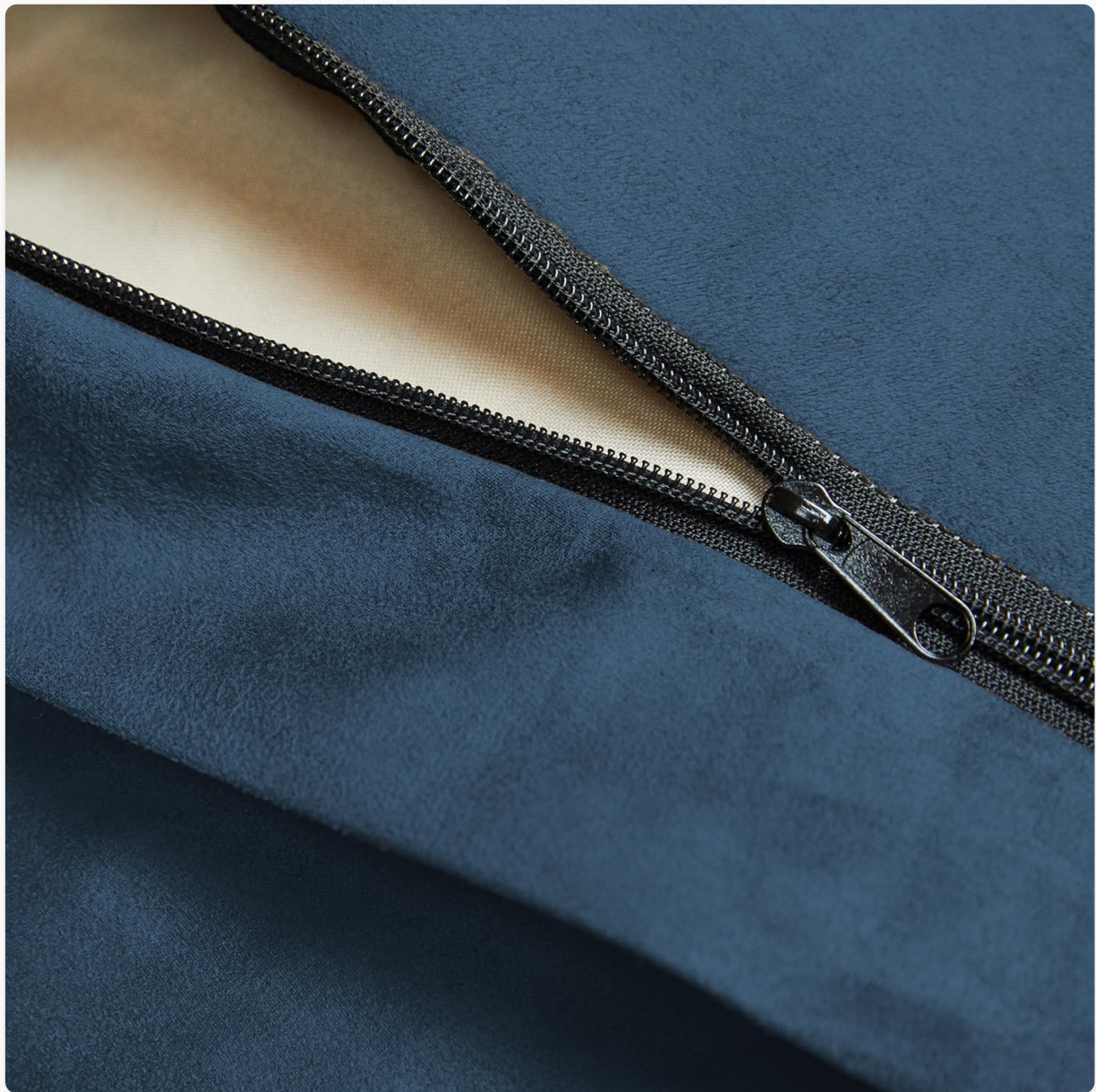
Image 6: A close-up of the robust zipper mechanism on the bean bag's outer cover, designed for durability and easy removal.