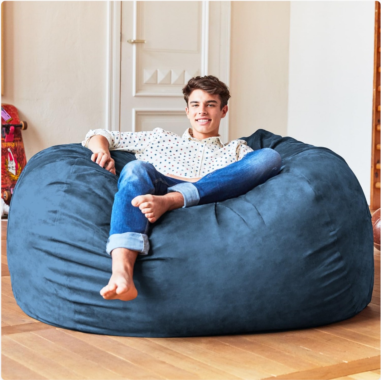
Image 4: A man casually seated on the 5ft navy blue bean bag chair, highlighting its spacious design.