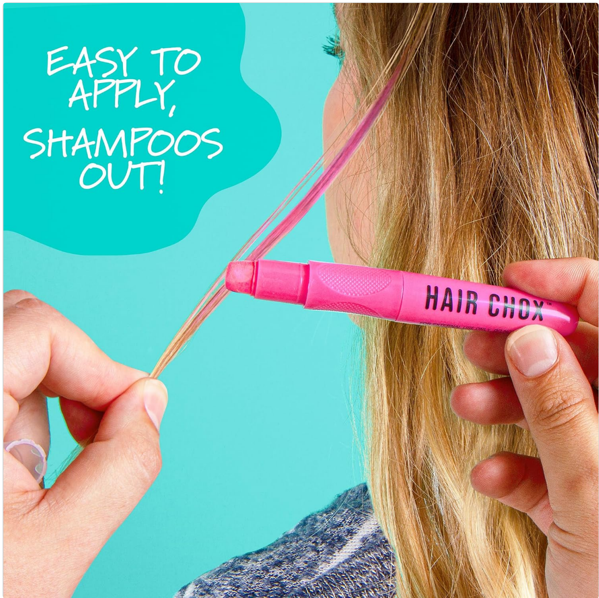
Image 4.1: Demonstrating the application of Hair Chox to a hair strand.