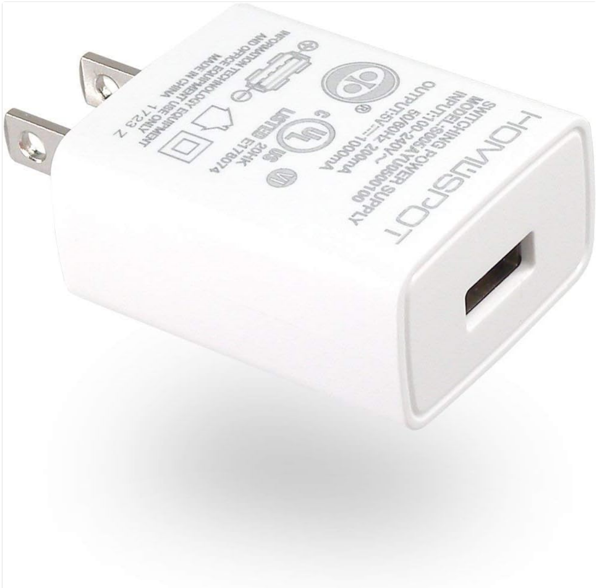
Image: The HomeSpot USB Wall Charger, highlighting its USB port and regulatory markings including the UL certification.