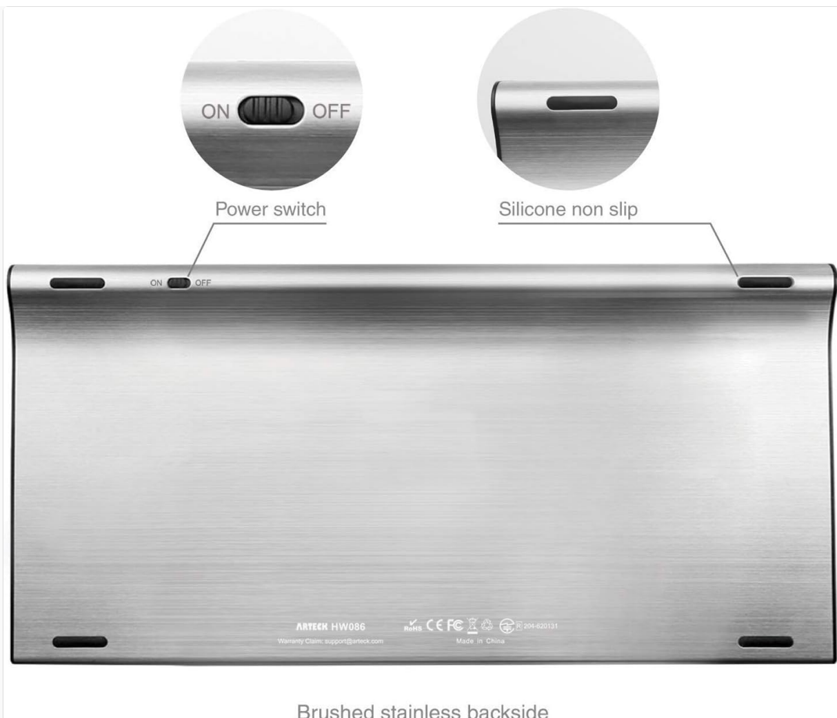
Figure 3: Power switch and silicone non-slip pads on the back of the keyboard.