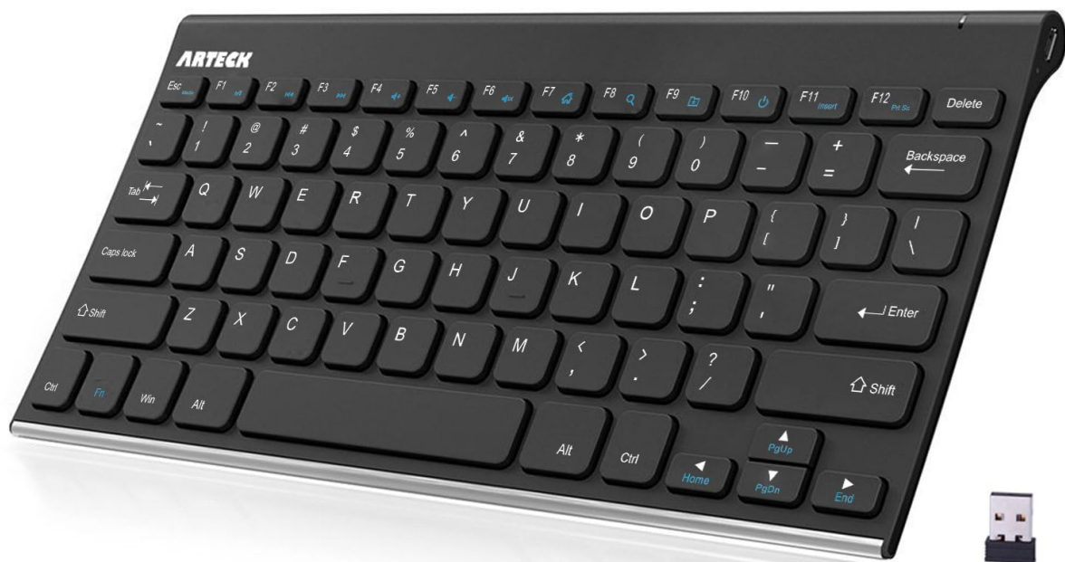
Figure 1: Arteck 2.4G Wireless Keyboard (Front View)