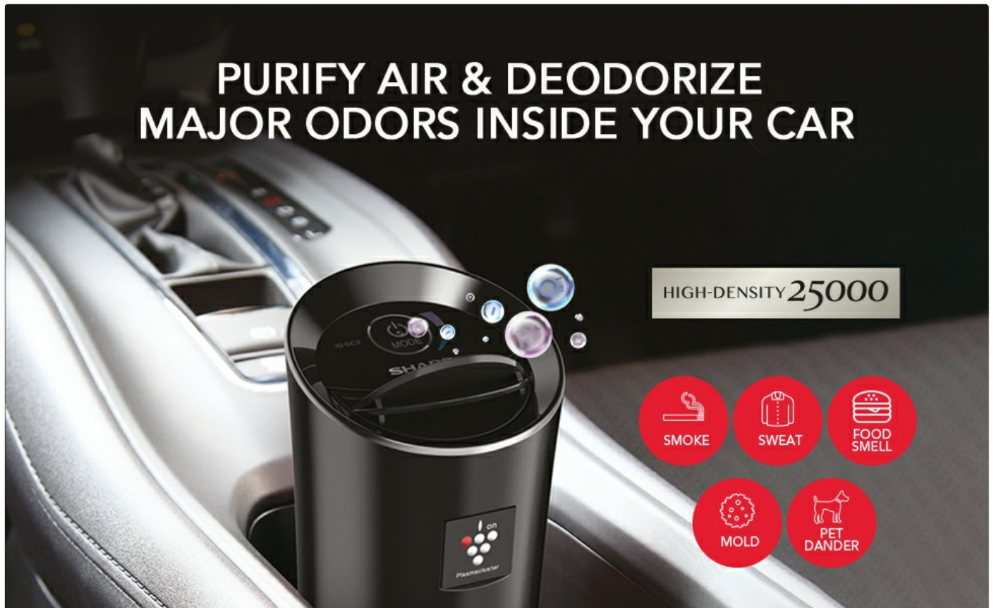
Image: Demonstrates the air purifier's effectiveness in removing mold odor from car air conditioners, smoking smell, and food odors.