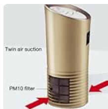
Image: The PM10 filter of the air purifier, highlighting its lifetime use and ability to trap fine dust particles.