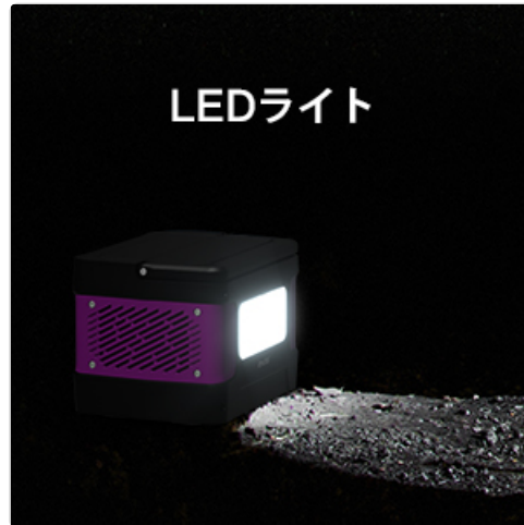
Image Description: The imuto T600-G Portable Power Station in a home setting, illustrating its function as a household storage battery.