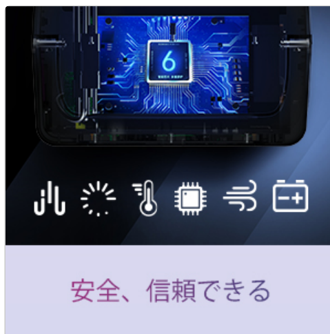
Image Description: An exploded view of the imuto T600-G Portable Power Station, illustrating its internal components and advanced safety management system, including BMS and smart temperature control.