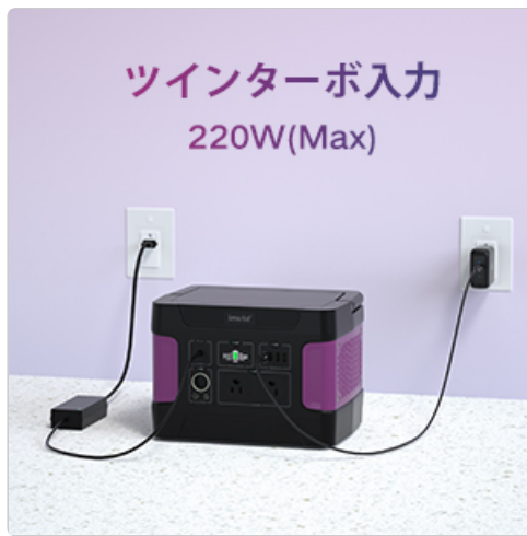
Image Description: A close-up image of the imuto T600-G Portable Power Station, emphasizing its large capacity and robust build.