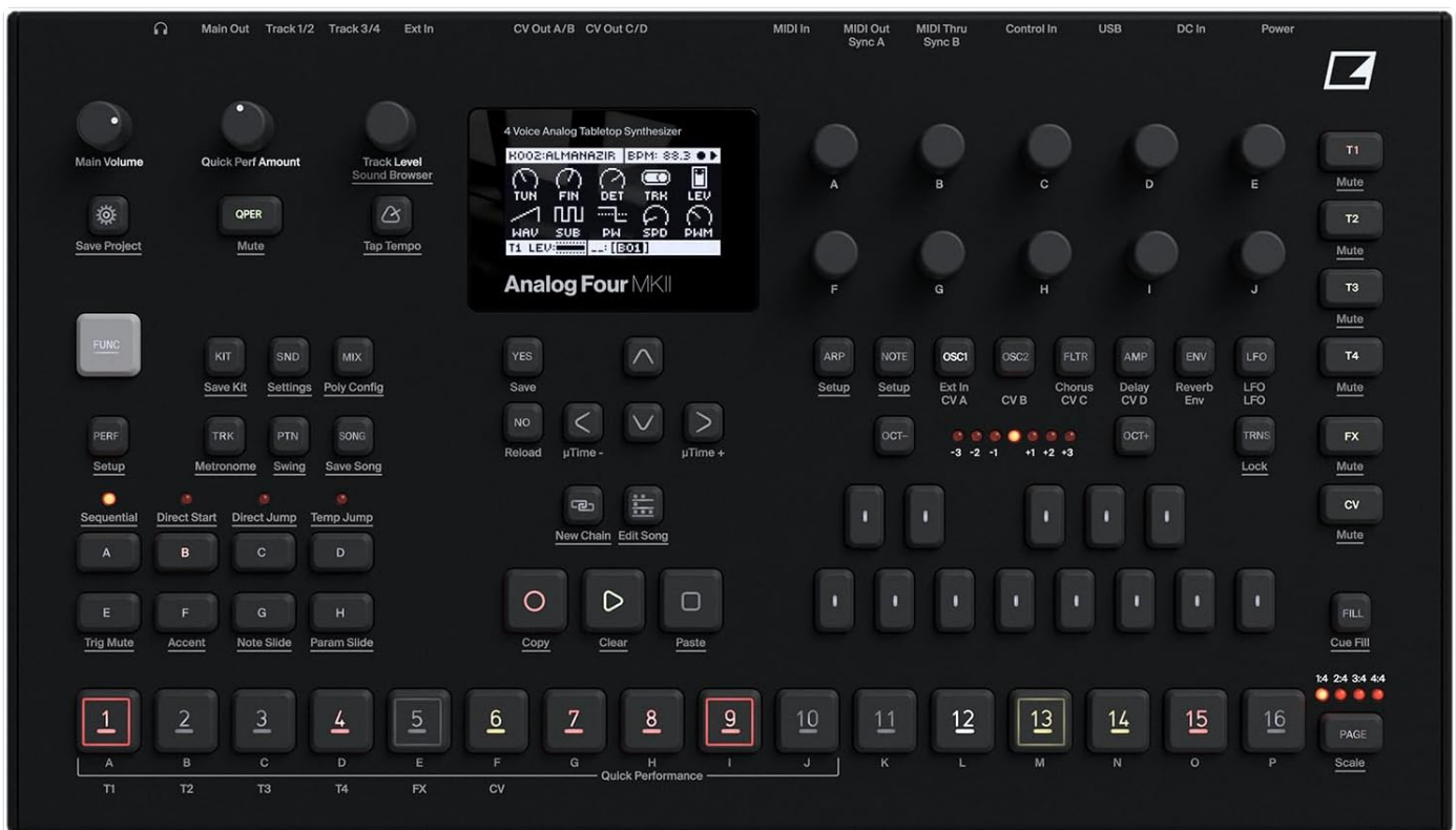
Figure 3: Detailed view of the Analog Four MKII's control surface, including the OLED screen, buttons, and encoders.