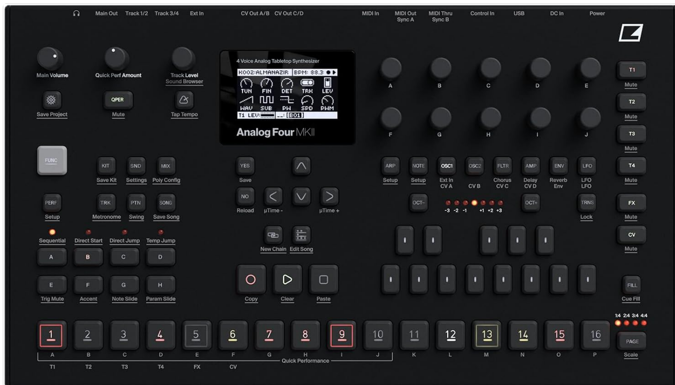
Figure 1: Front view of the Elektron Analog Four MKII Synthesizer.

The Elektron Analog Four MKII is a powerful 4-voice analog desktop synthesizer and CV sequencer, designed to provide deep sound design capabilities and intuitive sequencing. This manual provides essential information for setting up, operating, and maintaining your device.