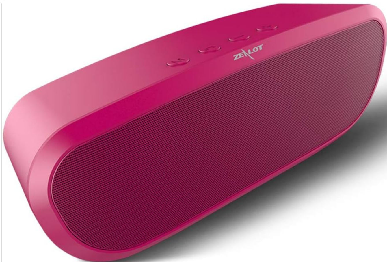
Image: Front view of the Zealot S9 Wireless Bluetooth Speaker, showcasing its compact design and speaker grille.

Thank you for choosing the Zealot S9 Wireless Bluetooth Speaker. This manual provides detailed instructions for setting up, operating, and maintaining your speaker to ensure optimal performance and longevity. Please read this manual carefully before use.