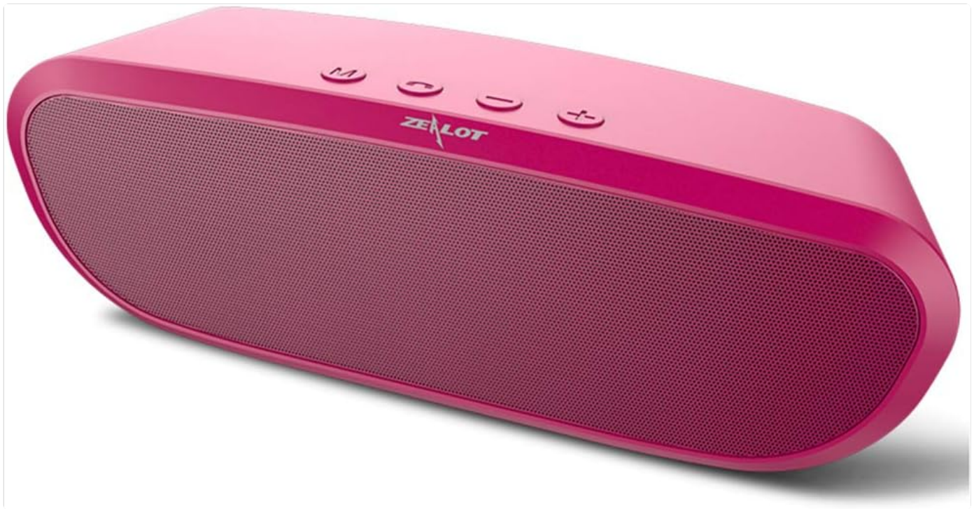
Image: Top view of the Zealot S9 speaker, showing the control buttons including power, mode, volume, and play/pause.