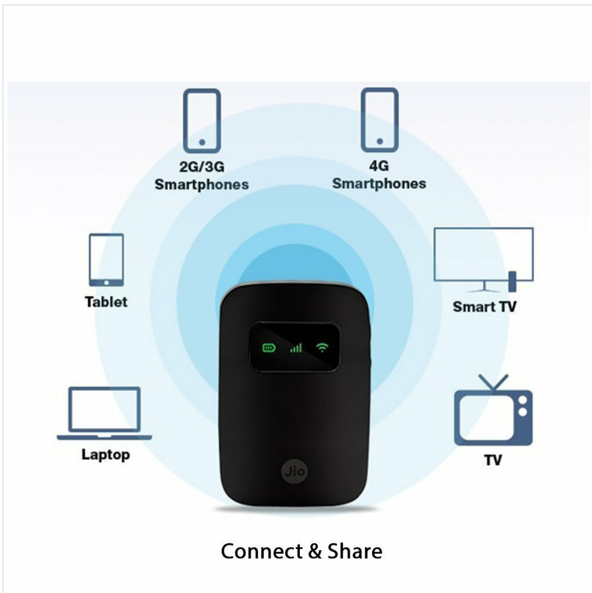
Figure 3: JioFi 3 connecting to multiple devices. This diagram illustrates the JioFi 3 device at the center, wirelessly connecting to various devices including 2G/3G Smartphones, 4G Smartphones, Tablets, Laptops, Smart TVs, and regular TVs, demonstrating its "Connect & Share" capability.