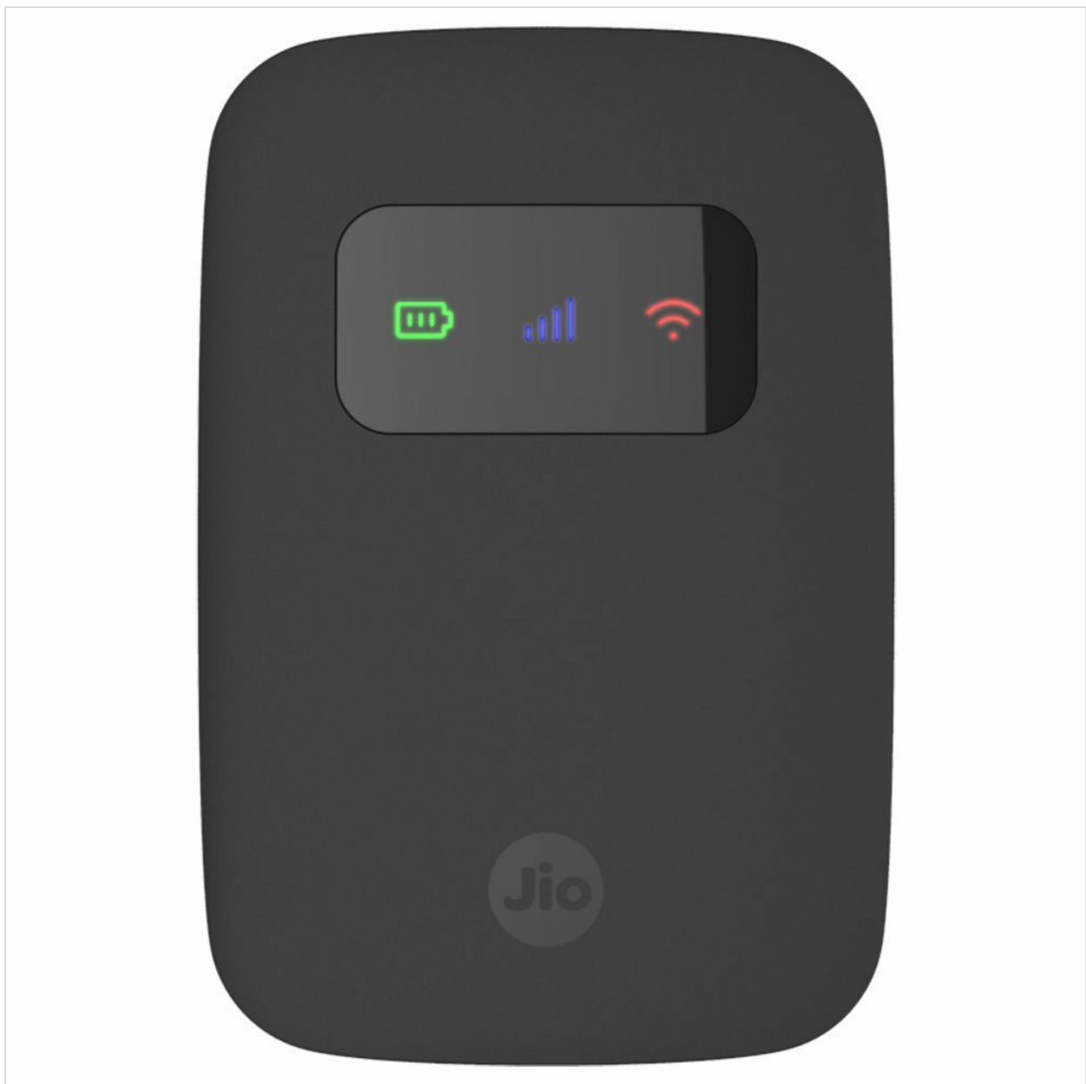
Figure 2: Front view of the JioFi 3 device. The image displays the black, rectangular JioFi 3 device with three indicator lights on the front: a battery icon, a signal strength icon, and a Wi-Fi icon. The Jio logo is visible at the bottom.