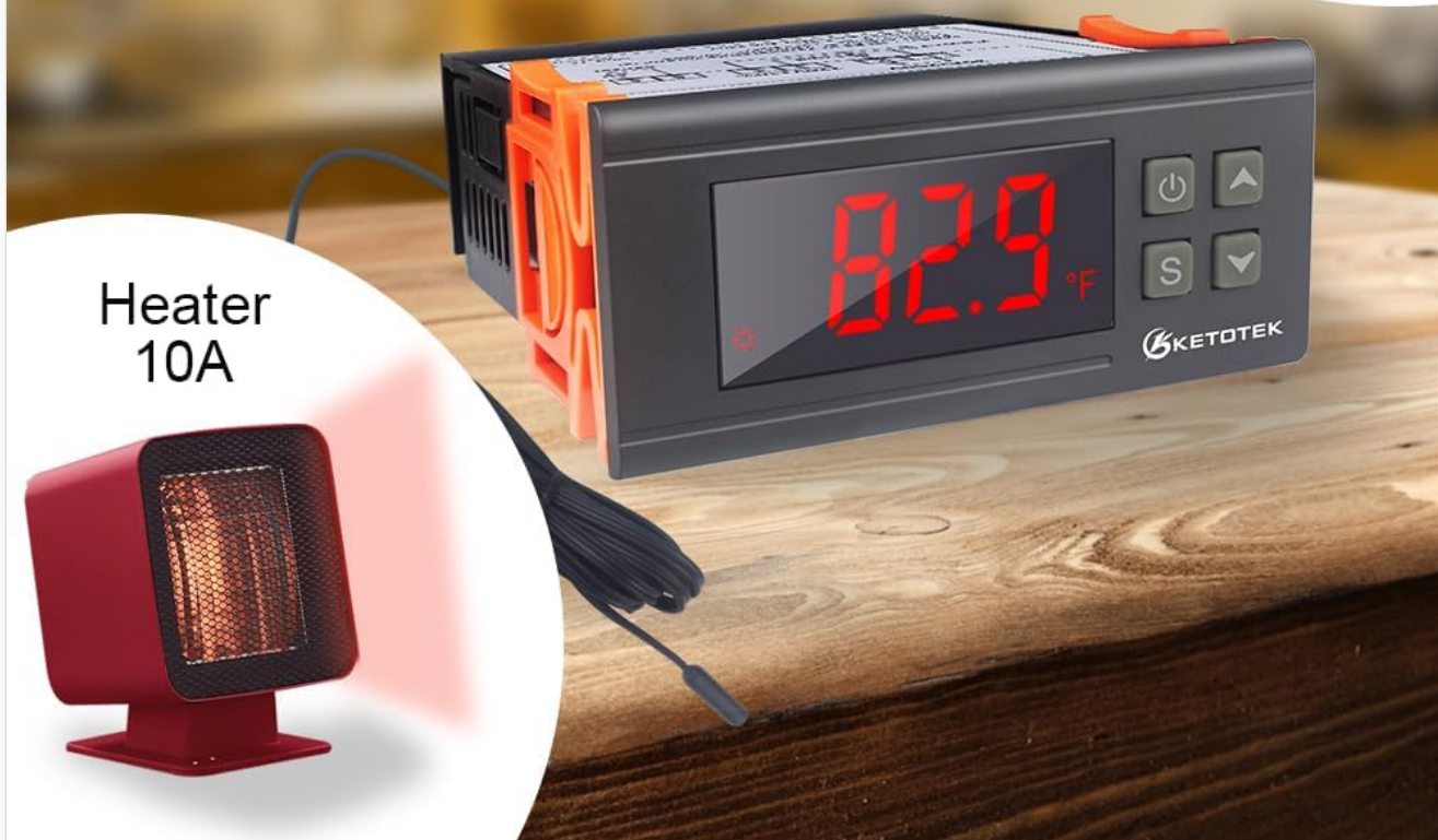
Image 5.2: The KETOTEK KT1000 controller shown connected to both a heater and a cooler, demonstrating its dual relay capability for simultaneous temperature management.