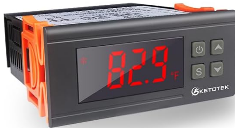
Image 2.1: Visual representation of key features including two relays, over-temperature and sensor error alarms, parameter saving, wide temperature range, temperature calibration, and output delay protection.