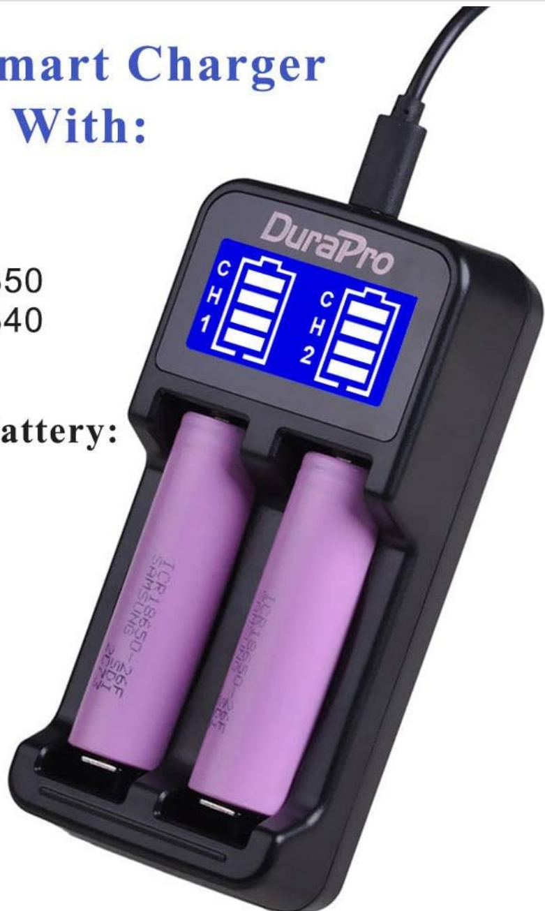
Image: The DuraPro charger with two purple 18650 batteries inserted, illustrating its compatibility with various battery types including Li-ion and Ni-MH/Ni-Cd.