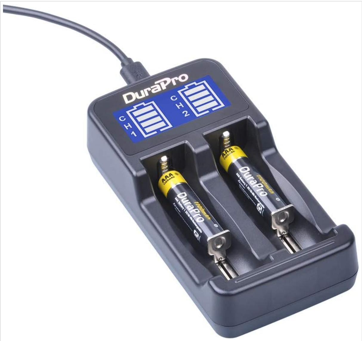
Image: The DuraPro charger with two yellow AA batteries inserted into the charging bays, demonstrating how smaller batteries fit.