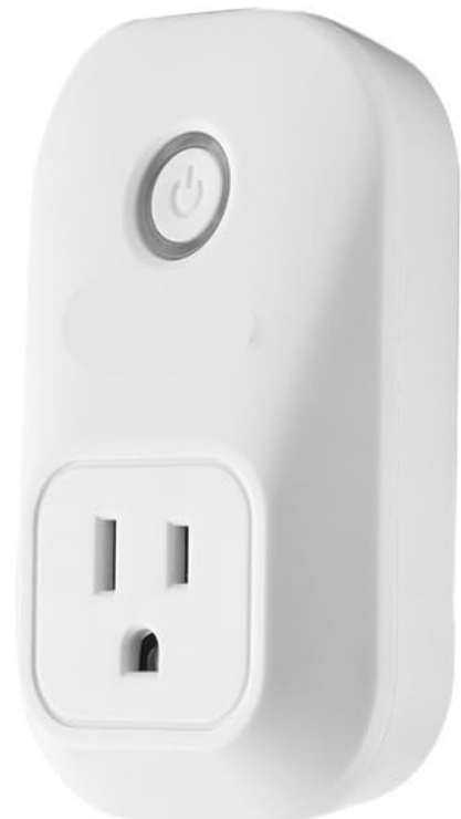
Image 4: Visual representation of controlling lights and appliances globally using a smartphone or tablet, highlighting the convenience of remote access.