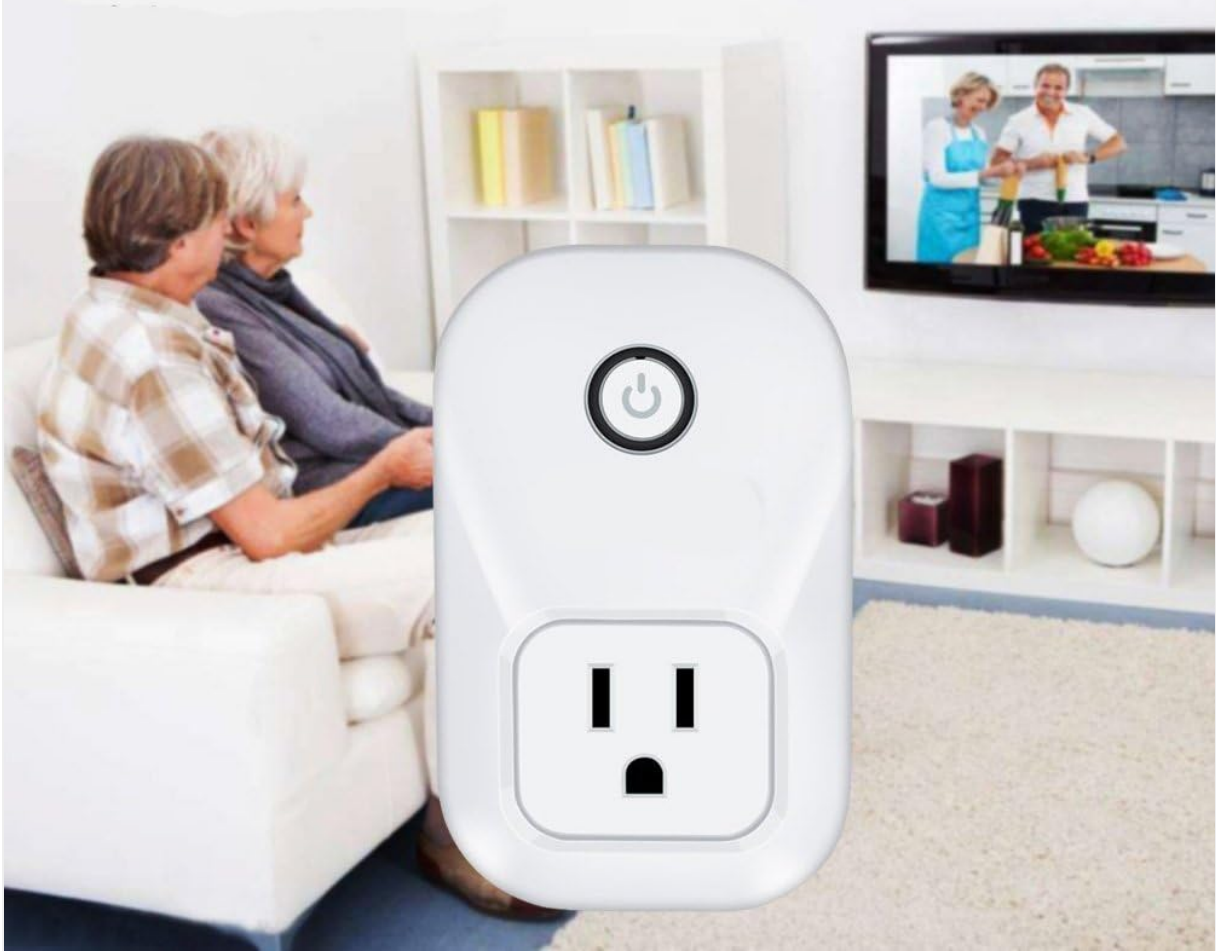
Image 7: Depiction of the Kaito Smart Plug being controlled by voice or phone, emphasizing its ease of use in a home setting.

Kaito Smart Plug makes it easy to Turn off any devices, by Phone or your voice