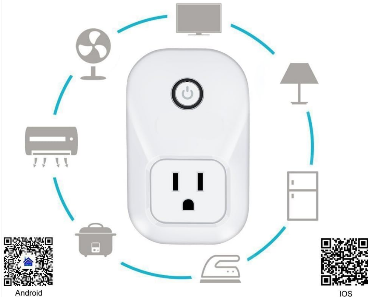
Image 3: Illustration of remote control capabilities using the Jinvoo Smart App, showing various appliances that can be controlled.

Simply access the Jinvoo Smart app on your phone or tablet to turn your devices on