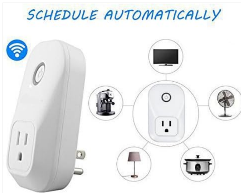
Image 5: Diagram illustrating the automatic scheduling feature of the Kaito Smart Plug, showing various appliances like a coffee maker, fan, and lamp being controlled.