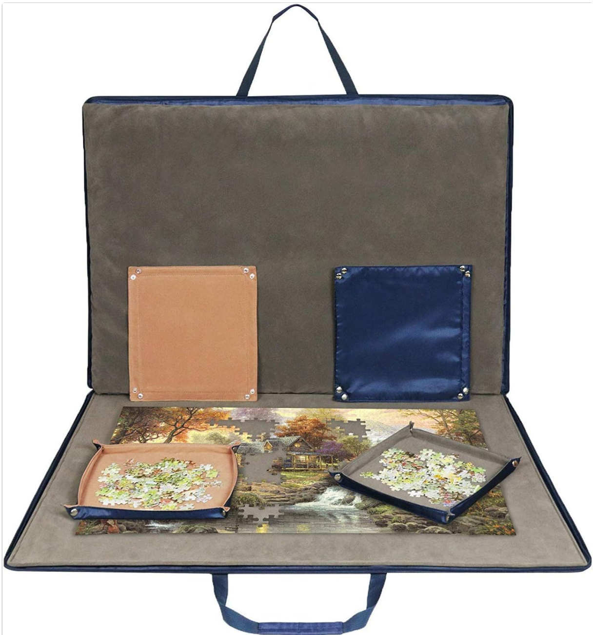
Image 1: The Lavievert puzzle board opened, showing a partially completed puzzle and two sorting trays in use.