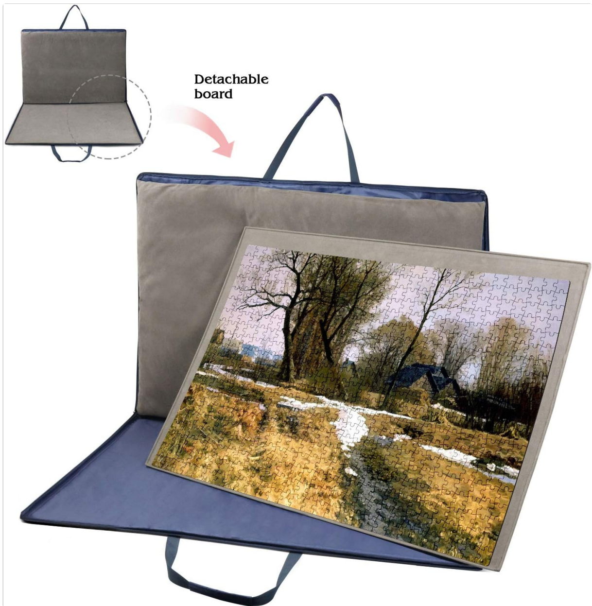
Image 2: The detachable main puzzle board being removed from the case.