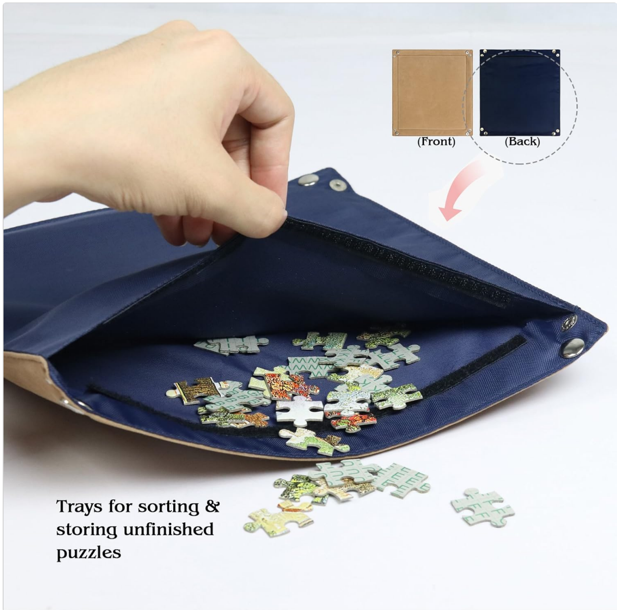
Image 4: A user actively sorting puzzle pieces on the main board, utilizing the sorting trays.