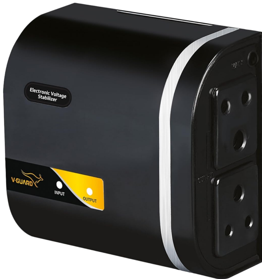
Image 1.1: The V-Guard Mini Crystal Supreme TV Stabilizer, a compact device designed to protect electronic appliances from voltage fluctuations.