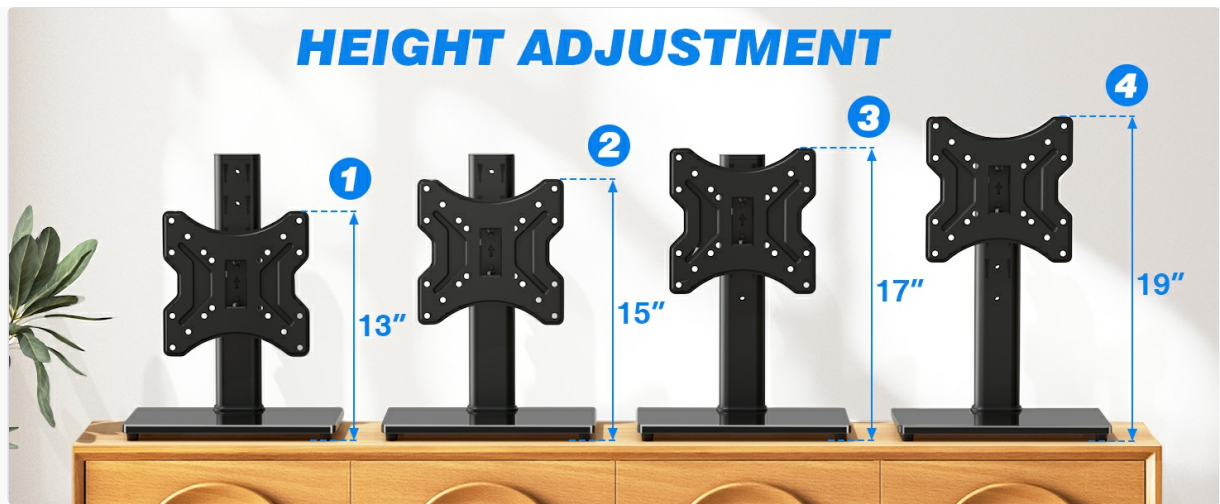
Image 5.2: Diagram illustrating the four different height adjustment levels available for the TV stand, showing the varying heights from the base to the top of the mounting bracket.