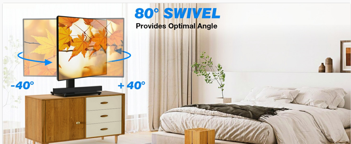
Image 5.1: Visual representation of the 80-degree swivel capability of the TV stand, showing how the screen can be angled left or right for optimal viewing.

The TV stand features a \pm 40^\circ swivel function, allowing you to adjust the viewing angle of your television without moving the entire stand. Gently rotate the TV to the desired angle. This is ideal for viewing from different positions in a room.