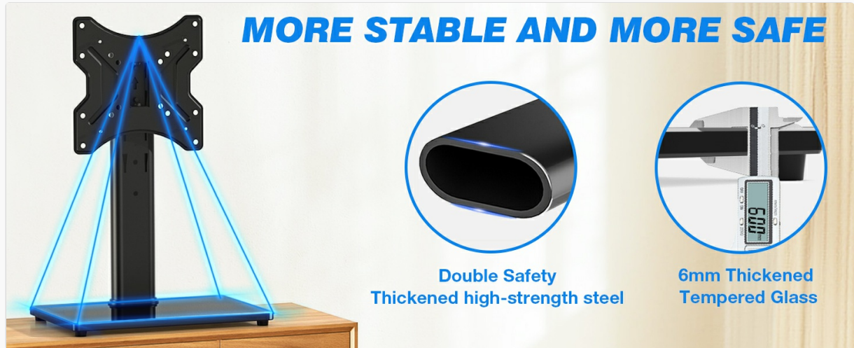
Image 2.1: Illustration highlighting the double safety features of the stand, including thickened high-strength steel and 6mm thickened tempered glass for enhanced stability and safety.