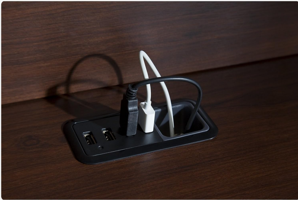
Figure 4.3: A dedicated storage compartment designed to hold and organize tablets and smartphones, often with cable pass-throughs for charging.