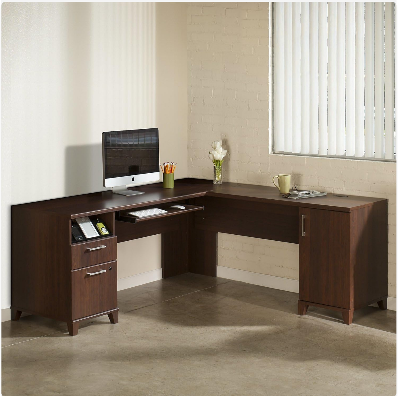
Figure 1.1: Fully assembled Latitude Run 4-Piece L-Shape Desk Office Suite, showcasing its spacious design and integrated features in a typical office environment.