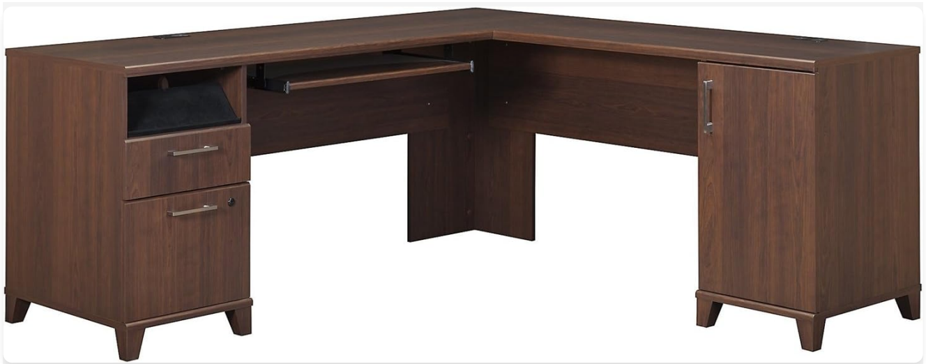
Figure 2.1: The complete Latitude Run L-Shape Desk Office Suite, providing a clear view of its structure and individual components before installation into a specific setting.