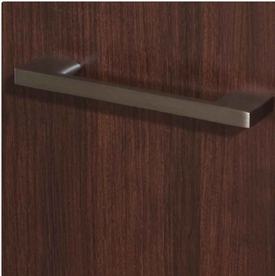
Figure 4.4: A close-up view of a drawer handle, highlighting the design and finish of the hardware used on the desk suite.

Utilize the various drawers and the cabinet for organizing files, office supplies, and personal items. The file drawer is typically designed to accommodate letter or legal-sized documents.