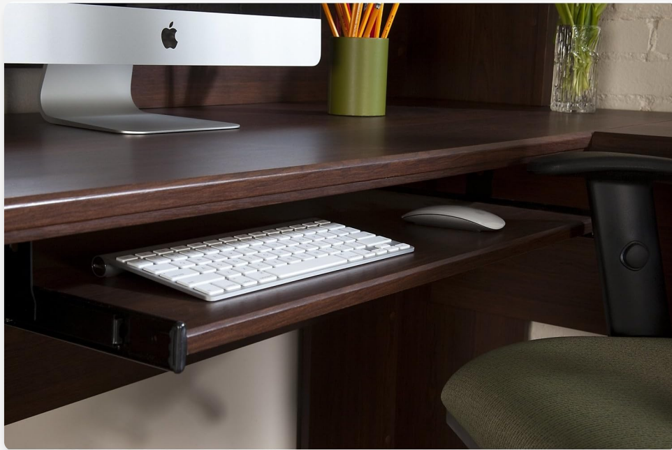
Figure 4.1: A detailed view of the pull-out keyboard tray, showing ample space for a keyboard and mouse, designed for ergonomic comfort.