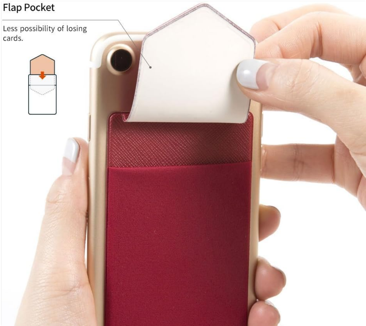
Image: A hand demonstrating the flap pocket feature, showing how the flap covers the cards to prevent them from falling out, with a small diagram illustrating the flap mechanism.