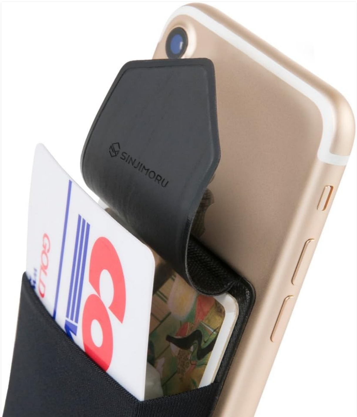
Image: A close-up view of the Sinji Pouch Flap attached to a smartphone, with the flap open and multiple cards partially visible, demonstrating card access.