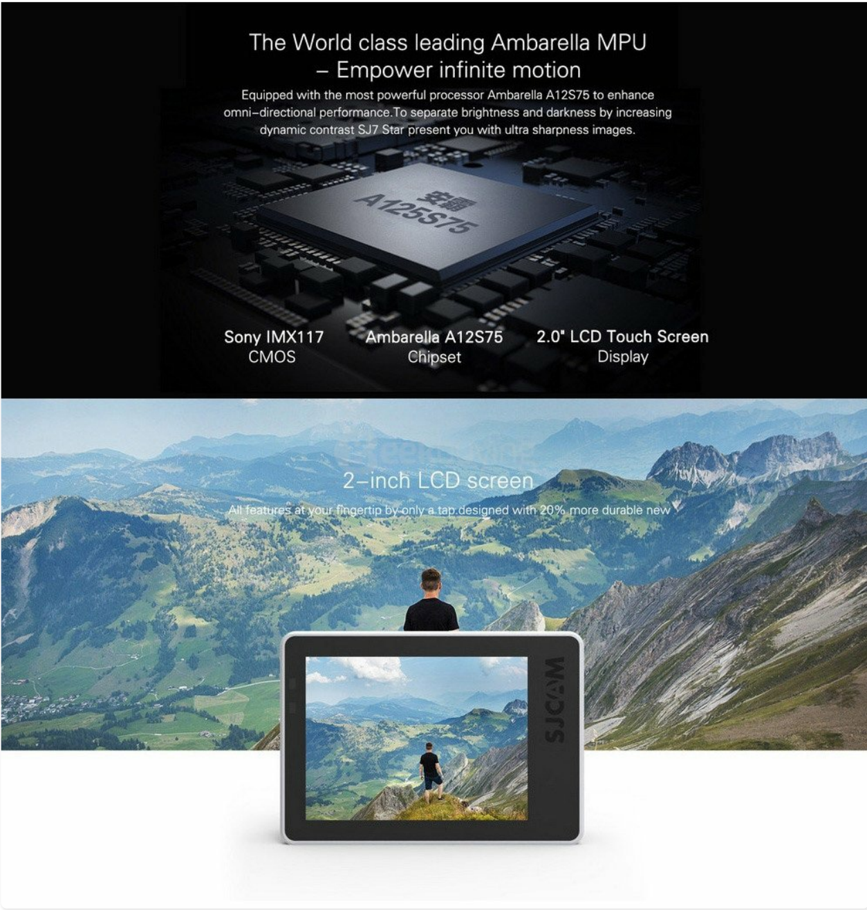
Image 7.1: Diagram illustrating the Ambarella A12S75 processor and Sony IMX117 CMOS sensor within the SJCAM SJ7 Star. This image highlights the core components responsible for the camera's image processing and performance.