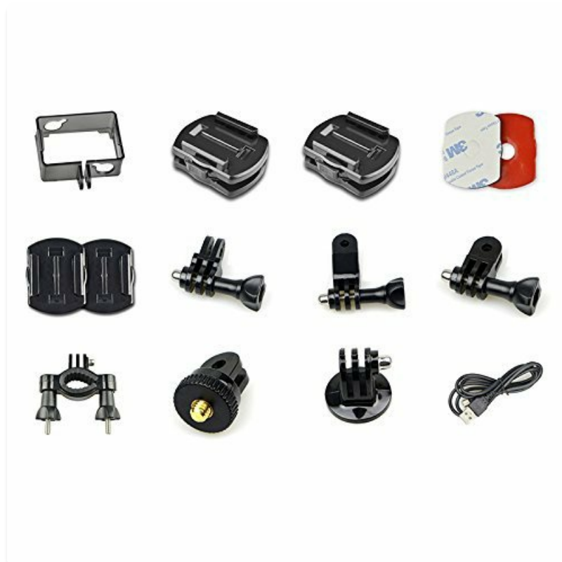
Image 2.1: Various mounting accessories and cables included with the SJCAM SJ7 Star. This image displays a collection of mounts, adhesive pads, and a USB cable, illustrating the comprehensive accessory kit.

Note: SJ Smart Remote and external microphone are not included in the standard package.