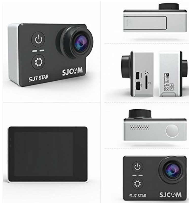
Image 3.1: Multiple views of the SJCAM SJ7 Star, showing its various ports and buttons. This composite image displays the camera from different angles, highlighting the power button, settings button, lens, and side ports for USB and MicroSD card.

Utilize the various mounts provided to attach your SJ7 Star to helmets, handlebars, or other surfaces. Refer to the specific mount instructions for secure attachment.