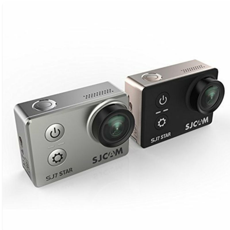
Image 1.1: SJCAM SJ7 Star Action Camera, available in silver and black finishes. This image displays the front view of two cameras, highlighting their compact design and lens.

The SJCAM SJ7 Star is a high-performance action camera designed to capture your adventures in stunning 4K resolution. Featuring an Ambarella A12S75 processor and a Sony IMX117 12MP sensor, it delivers clear images and smooth video. The camera includes a 2.0-inch touchscreen for easy navigation and a durable aluminum alloy housing. This manual provides essential information for operating and maintaining your device.