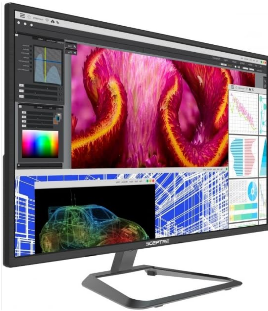
Figure 3.1: Sceptre 27 Inch IPS Ultra 4K LED Monitor U278W-4000R. This image displays the monitor from an angled front view, showcasing its slim bezels and the included stand.