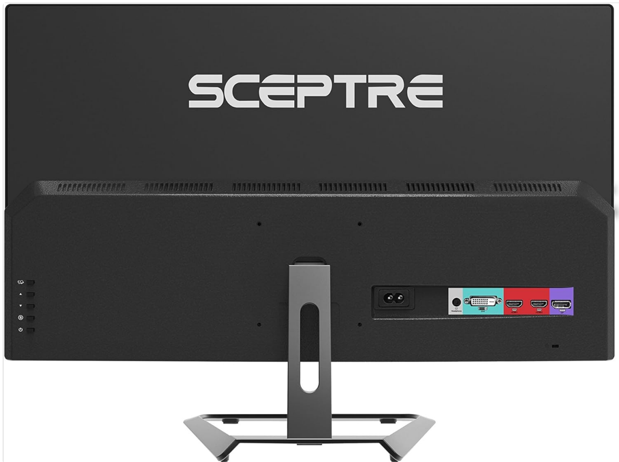
Figure 4.2: Rear view of the Sceptre 27 Inch IPS Ultra 4K LED Monitor, highlighting the various input ports including DisplayPort, HDMI, and DVI, along with the power input.