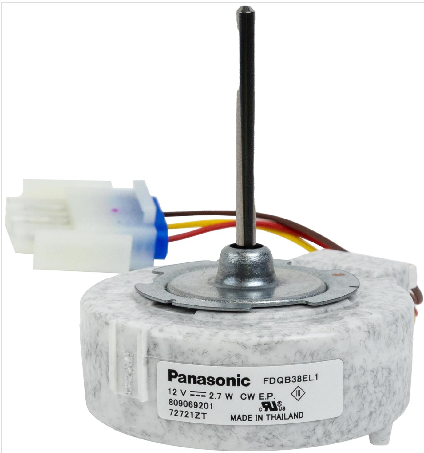
Image: Front view of the Frigidaire 809069201 Evaporator Fan Motor, showing the motor body, shaft, and electrical connector with wires. The label "Panasonic FDQB38EL1 12 V --- 2.7 W CW E.P. 809069201 72721ZT MADE IN THAILAND" is visible.