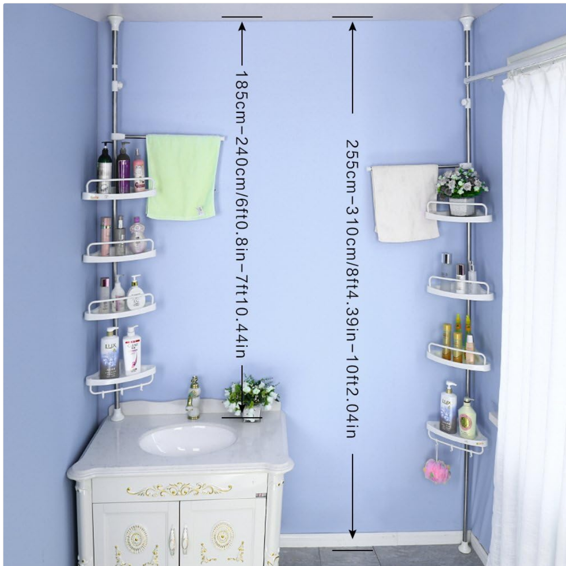
Figure 2: The tension pole offers two adjustable height ranges to fit various bathroom ceiling heights.