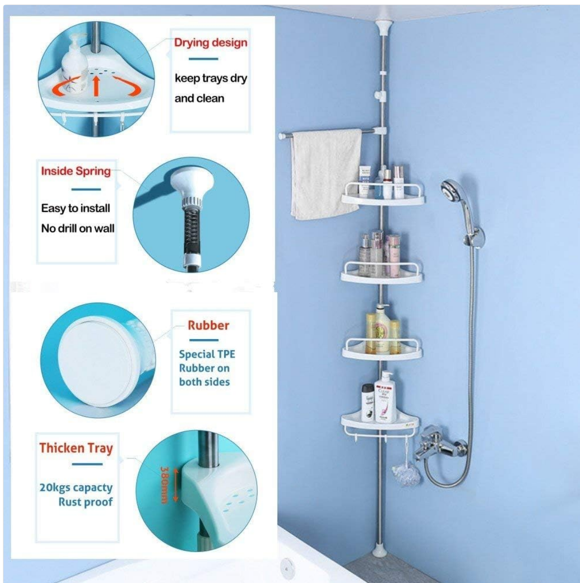
Figure 4: Key features such as the drying design for trays, internal spring for easy installation, special TPE rubber for stability, and thick, rust-proof trays with 20kg capacity.