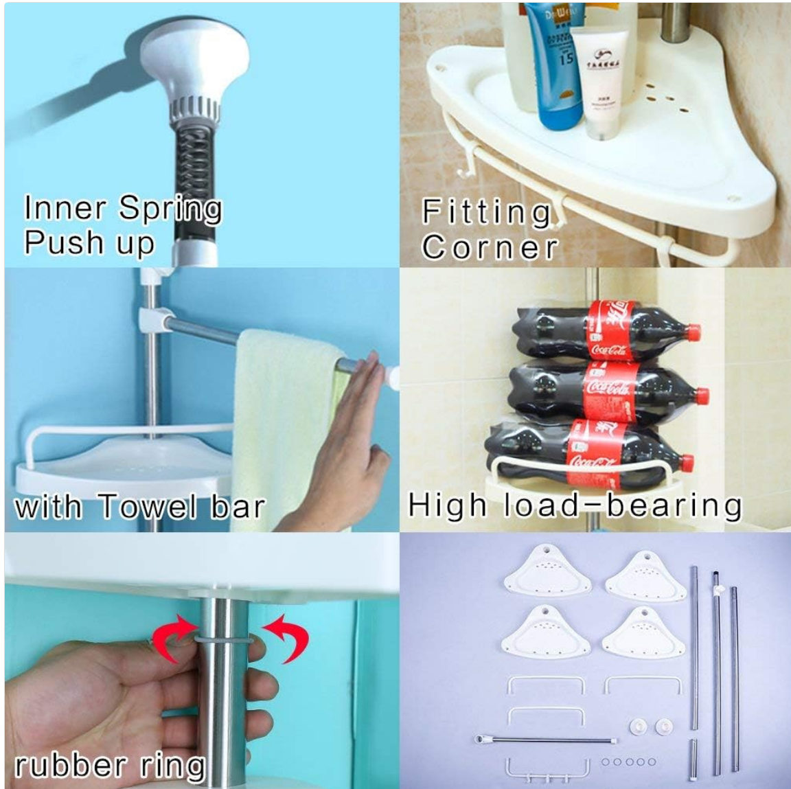
Figure 1: Overview of all included components, including pole sections, trays, towel bar, and small parts.