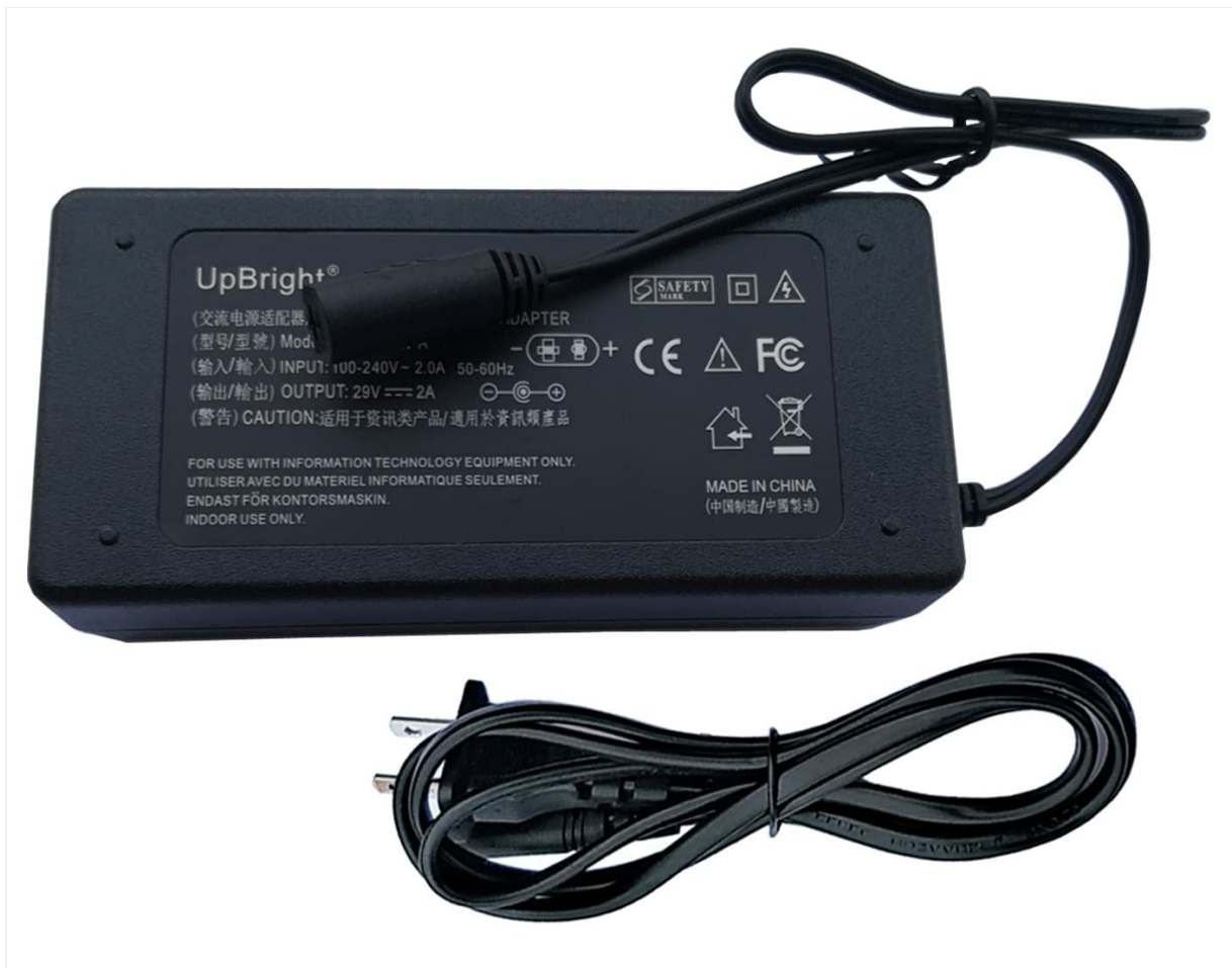
Image 1.1: Overview of the UPBRIGHT 29V AC/DC Power Adapter, showing the main unit and the 2-prong output connector.