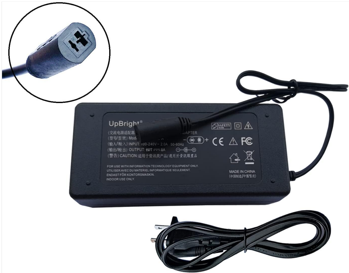
Image 4.1: Detail of the adapter's 2-prong output connector and the label indicating input/output specifications.

Once connected, the adapter may have an indicator light (if present) to confirm it is receiving power. Your device should now be ready for operation.