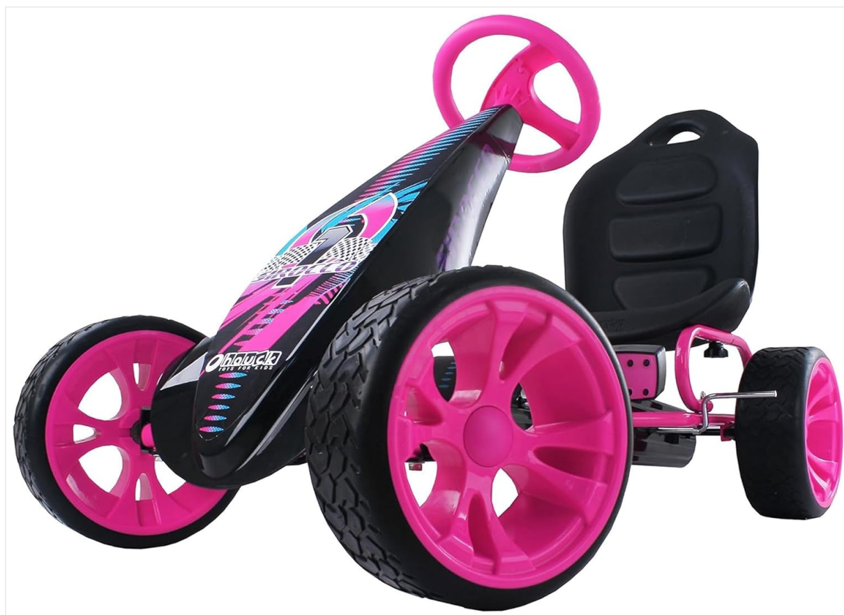
Figure 1.1: The Hauck Sirocco Pedal Go Kart, featuring its sporty design and pedal-powered mechanism.

The Hauck Sirocco Pedal Go Kart is designed to provide an authentic driving experience for young riders. This manual contains important information regarding the assembly, safe operation, and maintenance of your Go Kart. Please read it thoroughly before use and retain it for future reference.