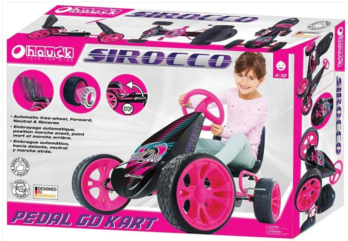
Figure 8.1: The product packaging, indicating the contents and key features.