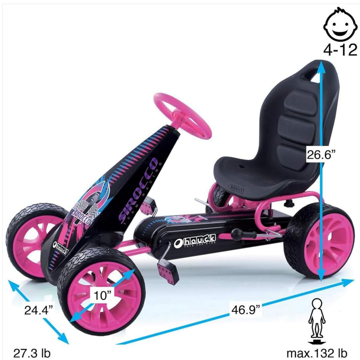
Figure 7.1: Visual representation of the Go Kart's dimensions.