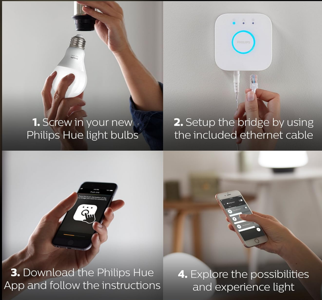
Image: Step-by-step visual guide for installing Philips Hue bulbs and connecting the Hue Bridge.