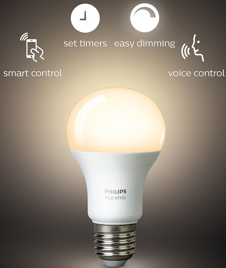
Image: An illustration highlighting smart control, timers, easy dimming, and voice control features of Philips Hue bulbs.