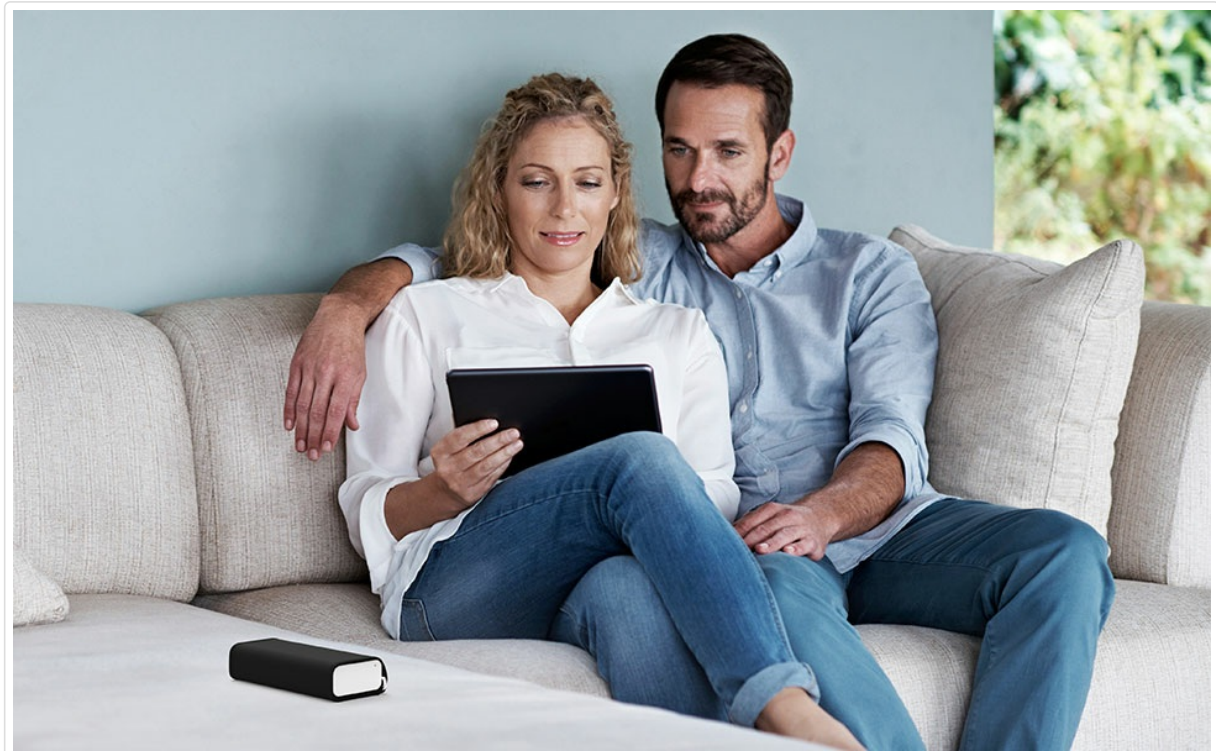
Figure 5: A couple reviewing health data on a tablet, demonstrating the ease of data access and sharing.