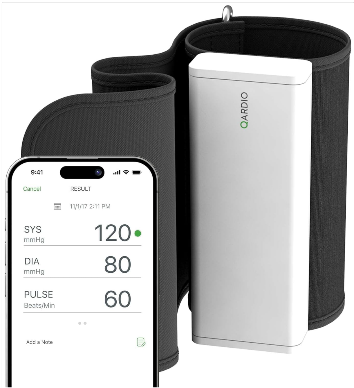
Figure 2: The QardioArm Blood Pressure Monitor shown alongside a smartphone displaying a blood pressure reading (SYS 120 mmHg, DIA 80 mmHg, PULSE 60 Beats/Min).