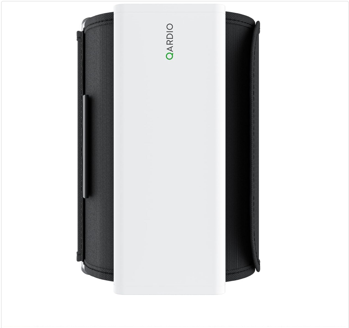
Figure 1: QardioArm Blood Pressure Monitor in its compact, folded state, ready for storage or transport.

The QardioArm is a sleek, portable blood pressure monitor consisting of a main unit integrated into an adjustable cuff. It features an automatic on/off mechanism activated by opening and closing the cuff.