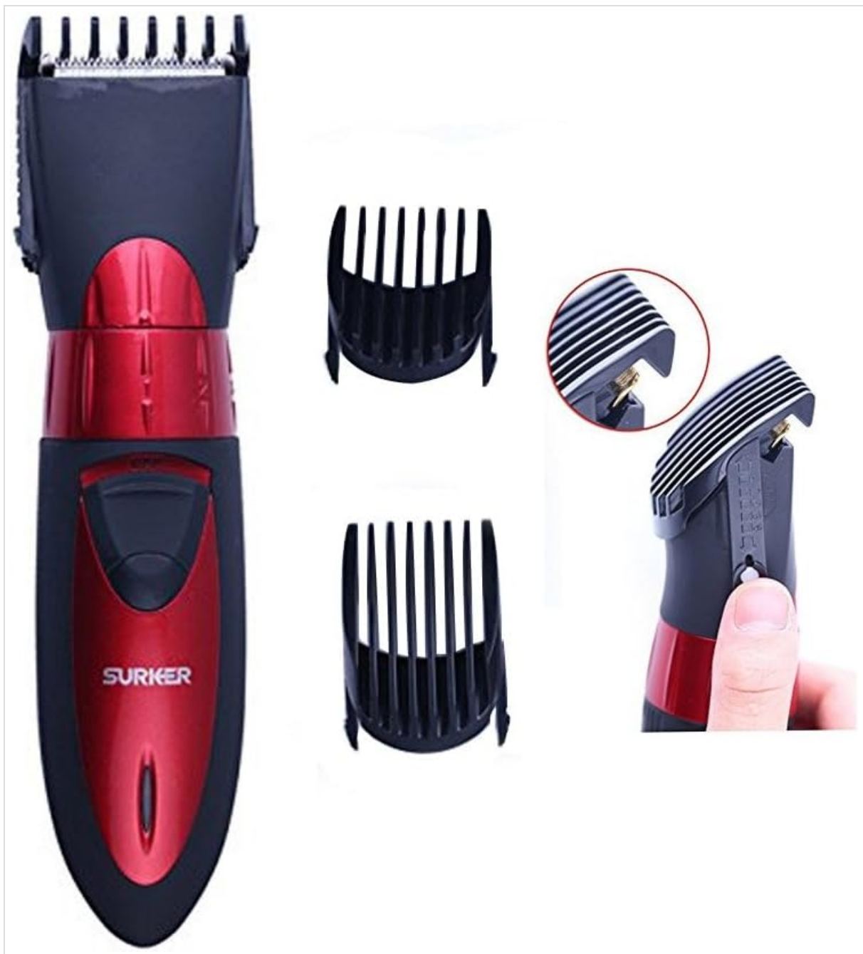
This image displays the SURKER HC-7068 Electric Hair Clipper in its black and red design, alongside its two included guide combs. A detailed inset shows the adjustable ceramic blade, highlighting its precision cutting capabilities.