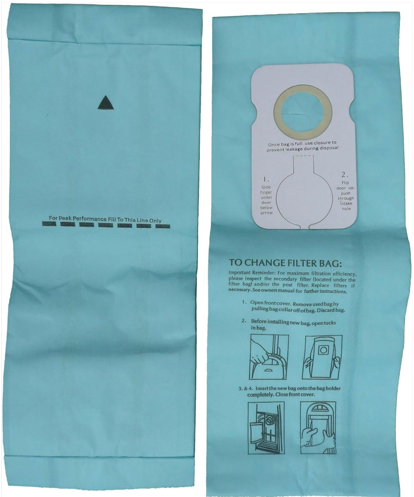
Image: This illustration demonstrates how to unfold and open the tucks of a new vacuum bag prior to installation.