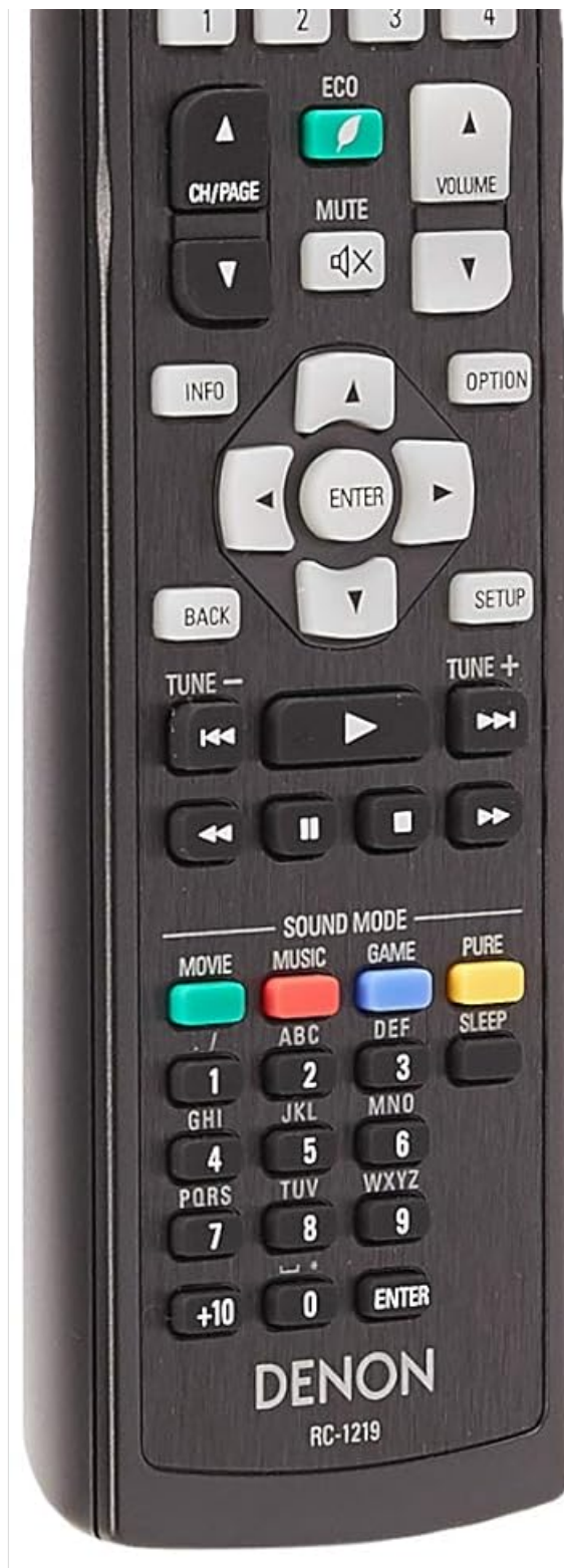
Figure 4: The remote control for the Denon AVR-X4400H, featuring dedicated buttons for input selection, volume, and sound modes.