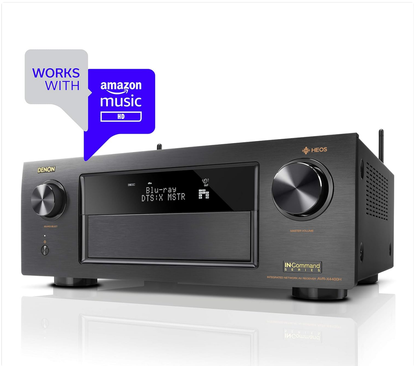
Figure 5: The Denon AVR-X4400H highlighting its compatibility with Amazon Music HD, demonstrating its advanced streaming capabilities.