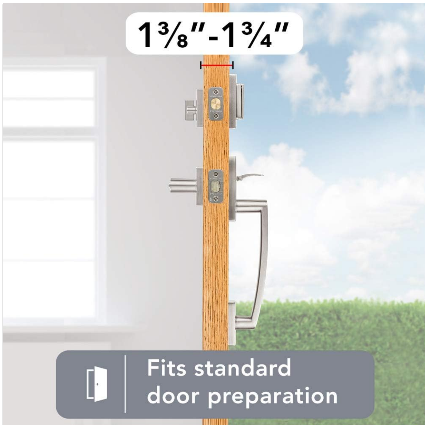
Image: Diagram illustrating standard door thickness (1-3/8" to 1-3/4") for handleset compatibility.