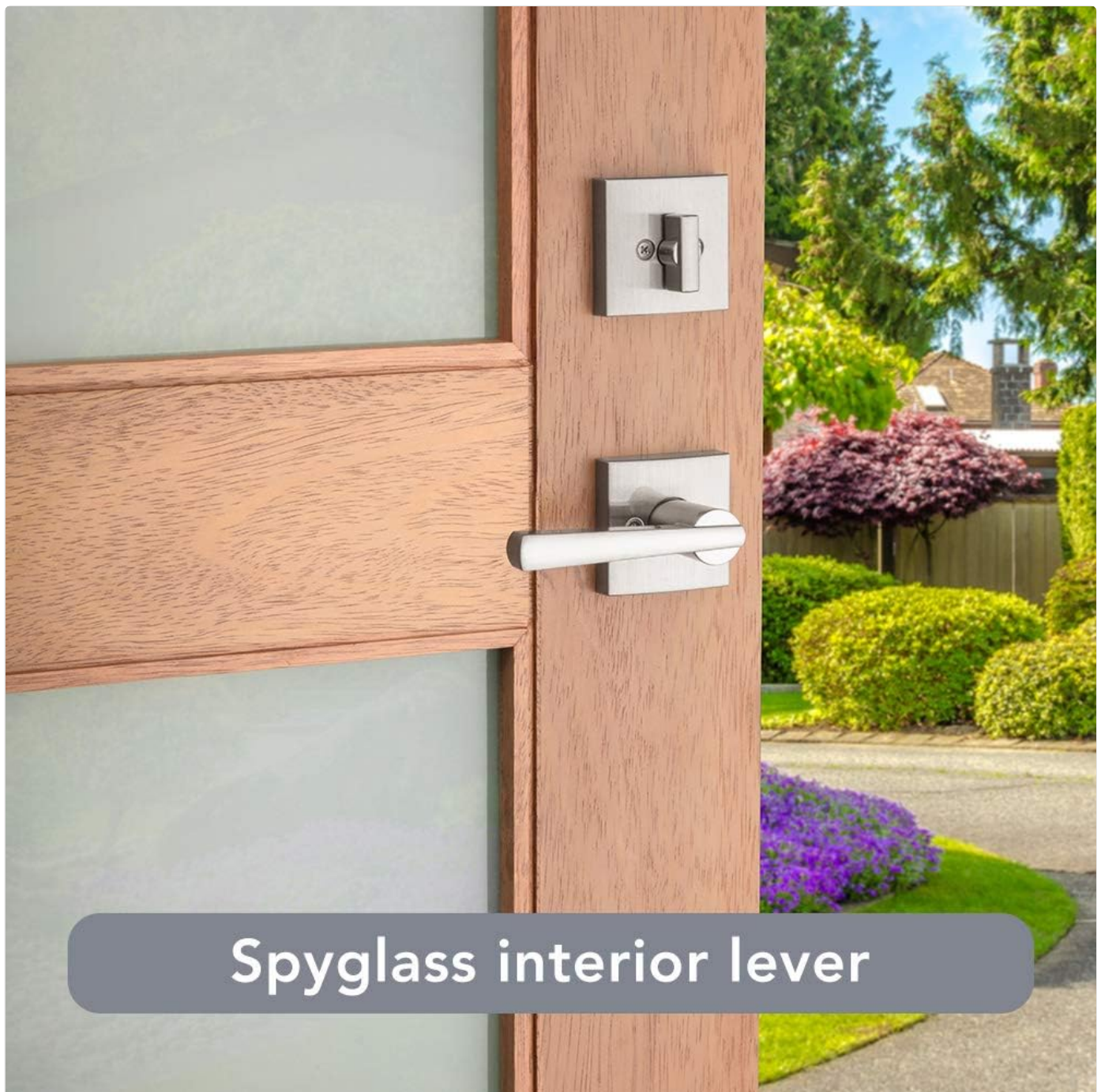
Image: Close-up of the Spyglass interior lever, demonstrating its sleek design.