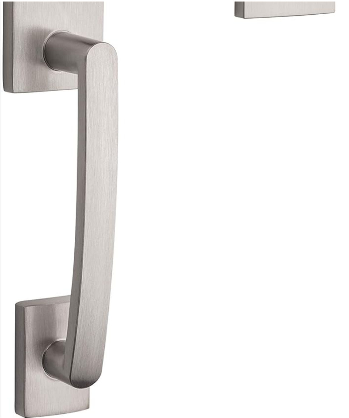
Image: Complete Baldwin Spyglass Front Entry Handleset in Satin Nickel, showing the exterior handle, deadbolt, and interior lever.

Your browser does not support the video tag.