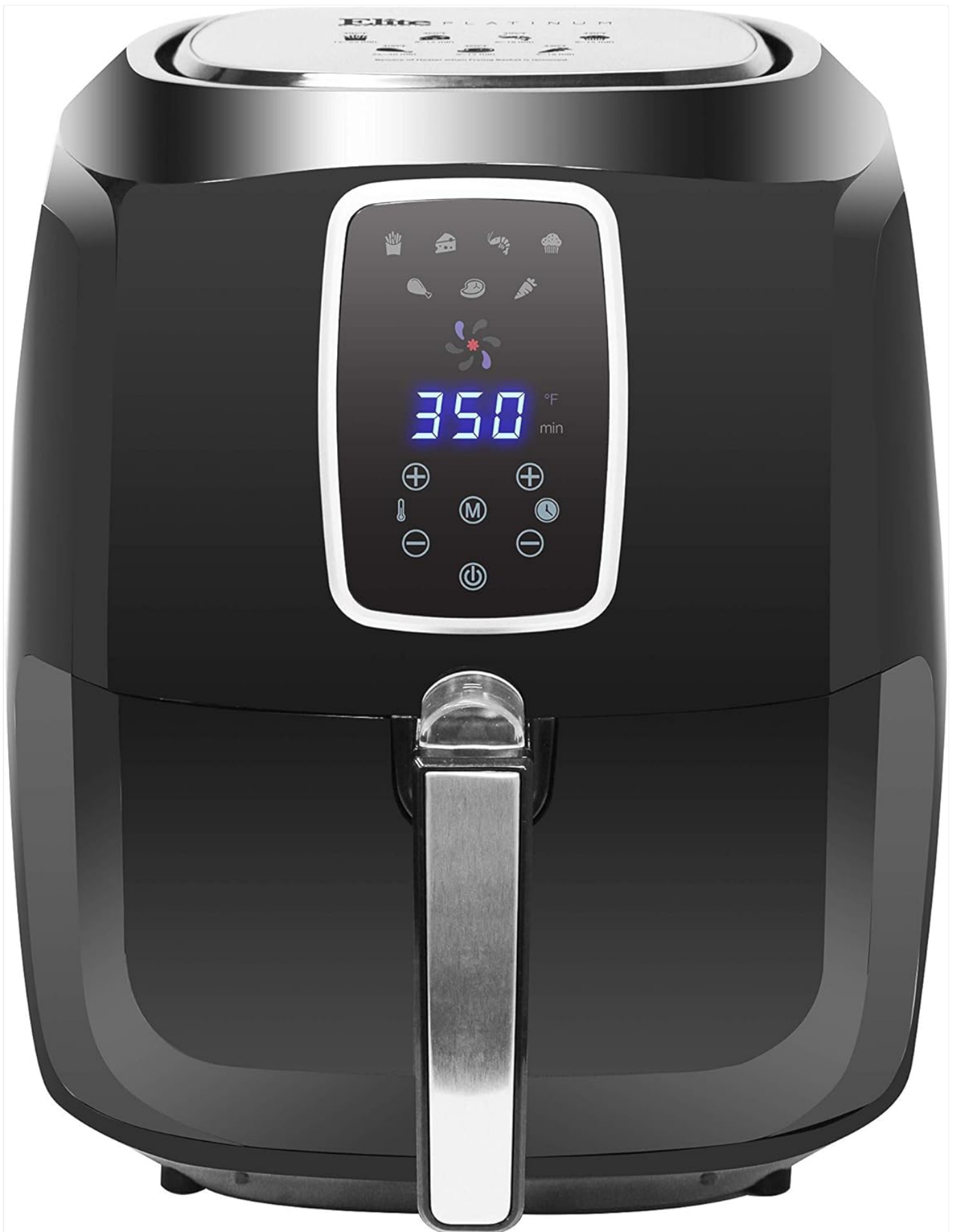
Figure 1: Front view of the Elite Platinum Digital Air Fryer, showcasing its sleek black design and intuitive digital control panel.