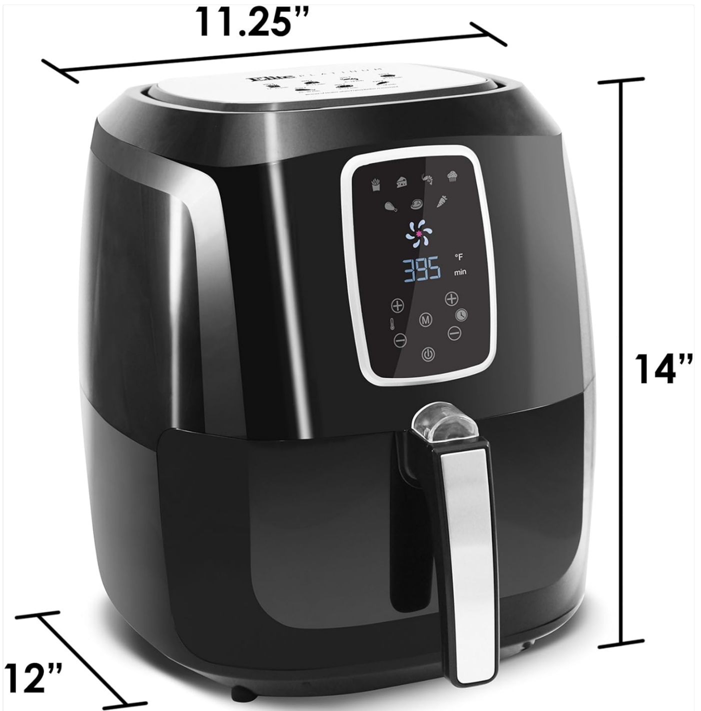
Figure 6: Diagram illustrating the overall dimensions of the Elite Platinum Digital Air Fryer.