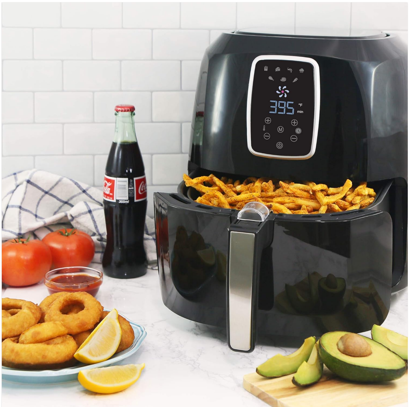
Figure 4: The air fryer in use, with the basket containing crispy French fries, demonstrating its cooking capability.