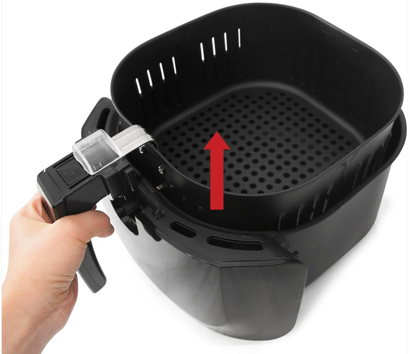
Figure 2: Illustration of the removable non-stick basket, designed for easy serving and cleanup.