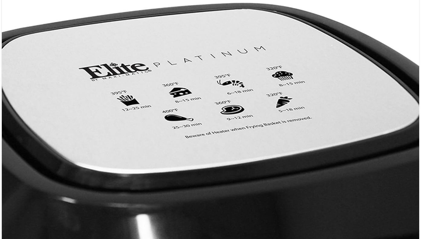
Figure 5: Close-up of the air fryer's top panel, displaying the recommended temperature and time settings for various food types like fries, cheese, seafood, bake, chicken, steak, and vegetables.